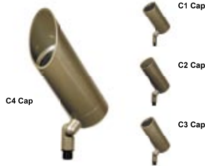
Model FL12 Line Voltage PAR16 Halogen (75W) PAR20 Halogen (50W) Fluorescent (9W) LED (2½W)