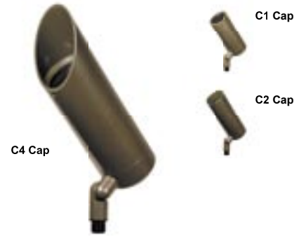
Model FL14 Line Voltage MR16 Halogen (75W) LED (2W)