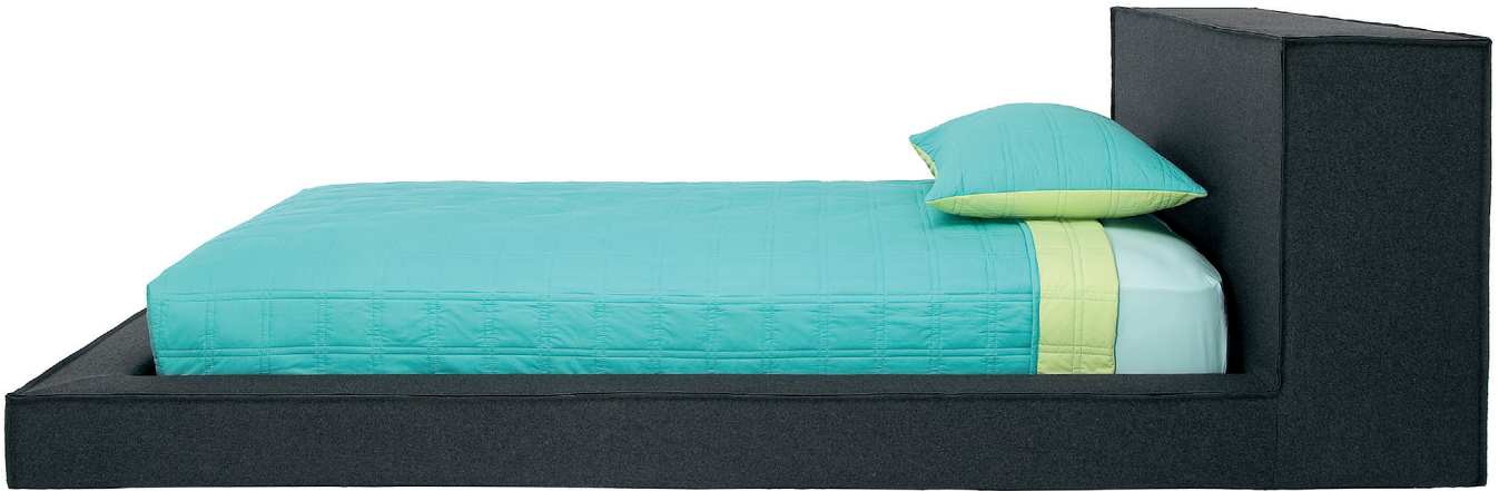
Twin size pictured