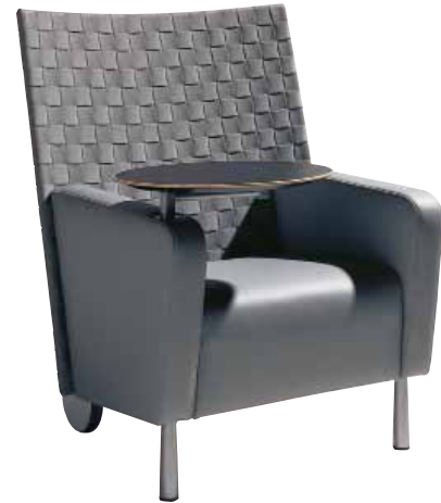
Webb 11-SI / WB-PT-R-BB / WB-Wheels-SI