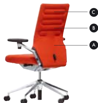
The innovative technology for healthy comfort is hidden within the elegant backrest.