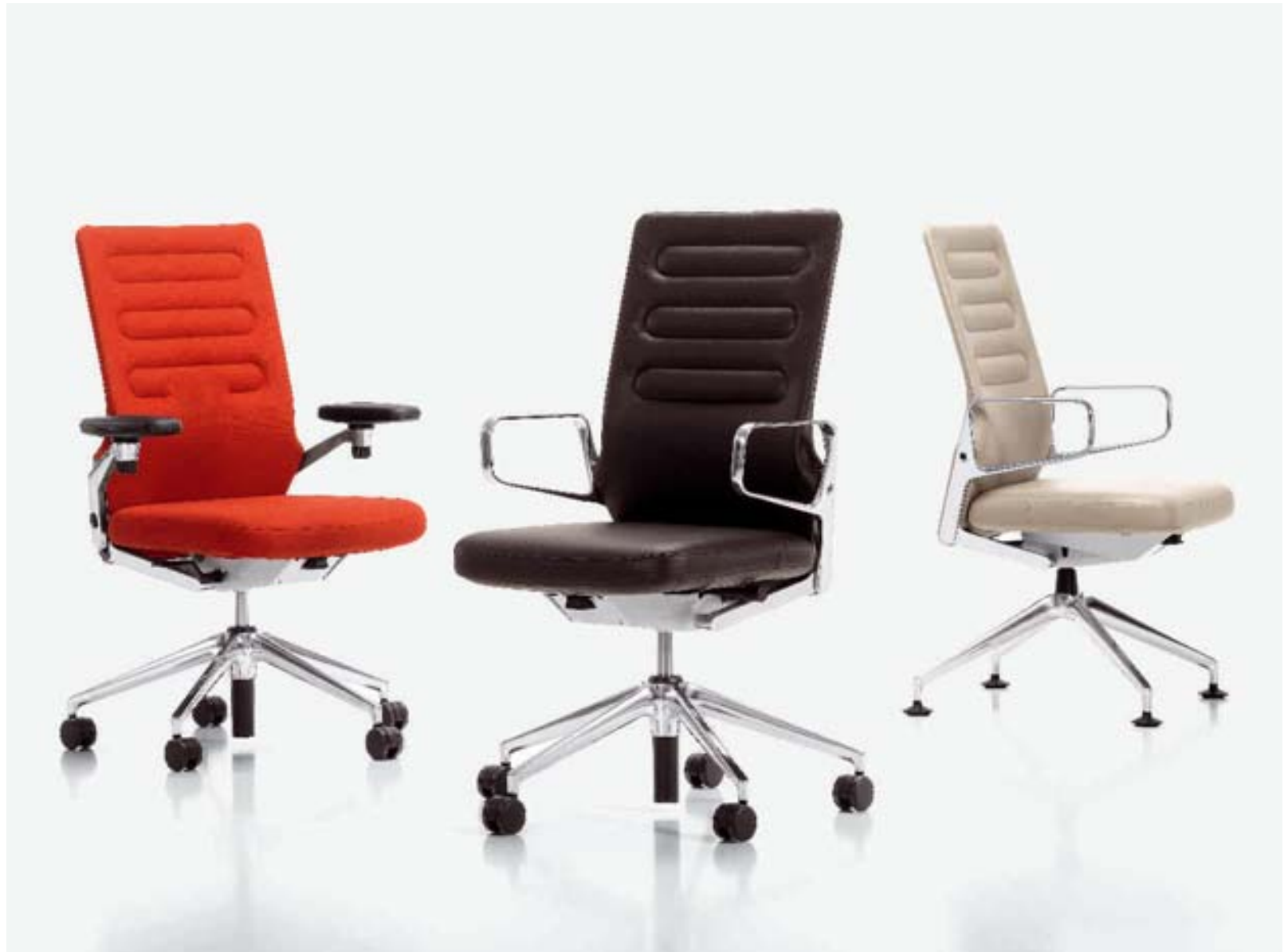
The AC 4 is available in various models to match the required purpose – its four-star base is ideal for conferences.

51% of the materials used to produce the AC 4 are recycled and 94% of all materials are recyclable.