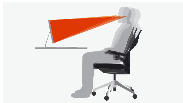
The head and neck areas are supported, which in turn prevents tension.