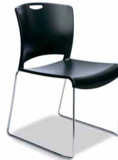
quickstacker | NO ARMS

Quickstacker blends form with function for a slim, attractive profile. The plastic contour-molded seat and back provide added comfort, while allowing stacking of up to 40 chairs high on a dolly. Available in six popular colors, it's ideal for convention halls, seminar rooms, meeting areas and auditorium settings. Options include ganging, with- or without arms and glides.