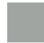
Warm Grey (WGR)