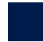
Deep Blue (DPB)

Due to inconsistencies of computer monitors and printers, we cannot guarantee colors shown are totally correct.