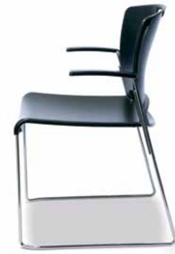
quickstacker | WITH ARMS