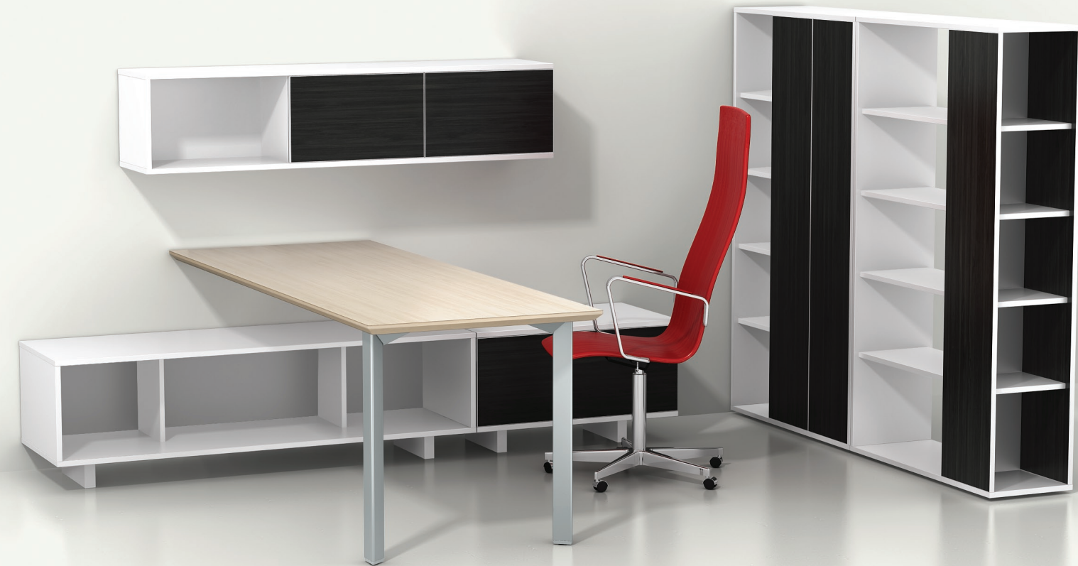
OVERHEAD (Closed), 30x78 DESK, CREDENZA (Open), CREDENZA (Top Access), WARDROBE (Front Access), BOOKCASE (Open & Side Access)