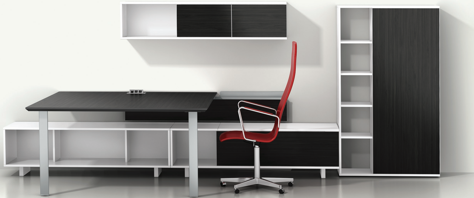
OVERHEAD (Closed), 60x60 DESK, POWER/ DATA DROP-IN, LEDGEWALL, CREDENZA (Open), CREDENZA (Top Access), WARDROBE (Side Access)