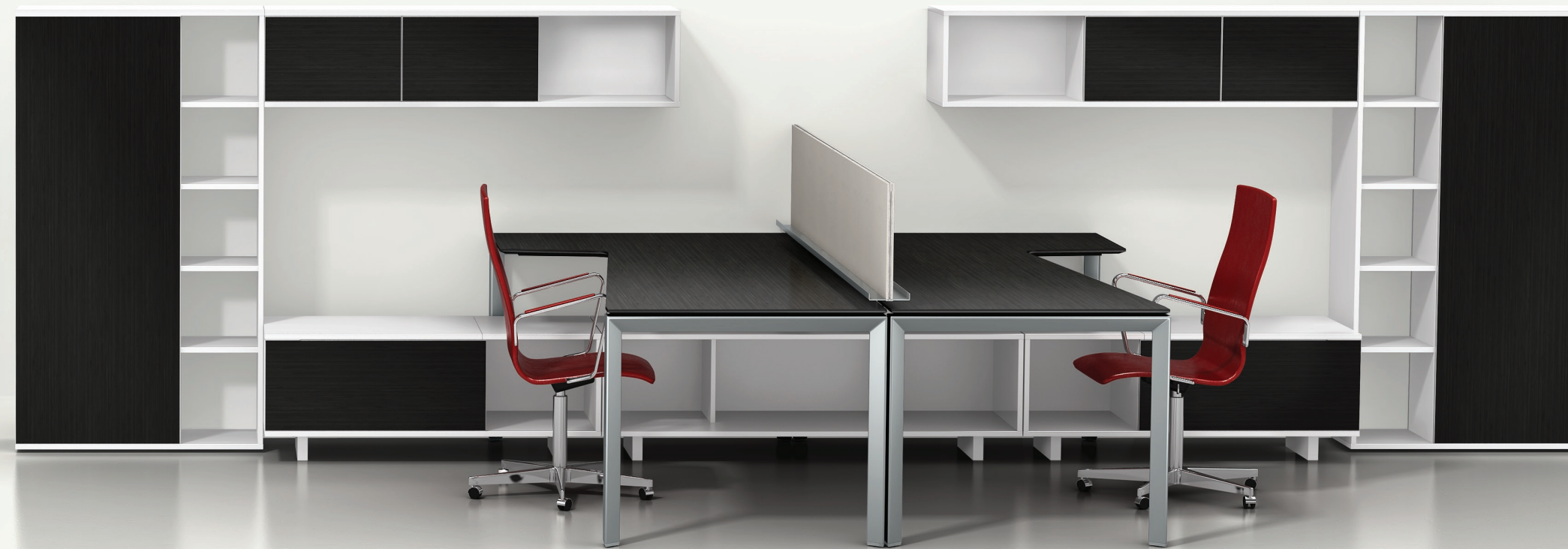
INTEGRATED COLLECTION: ALL STORAGE COMPONENTS (M2/O), SEIRI SCREEN (M2), 48x72 DESKS (Miro)