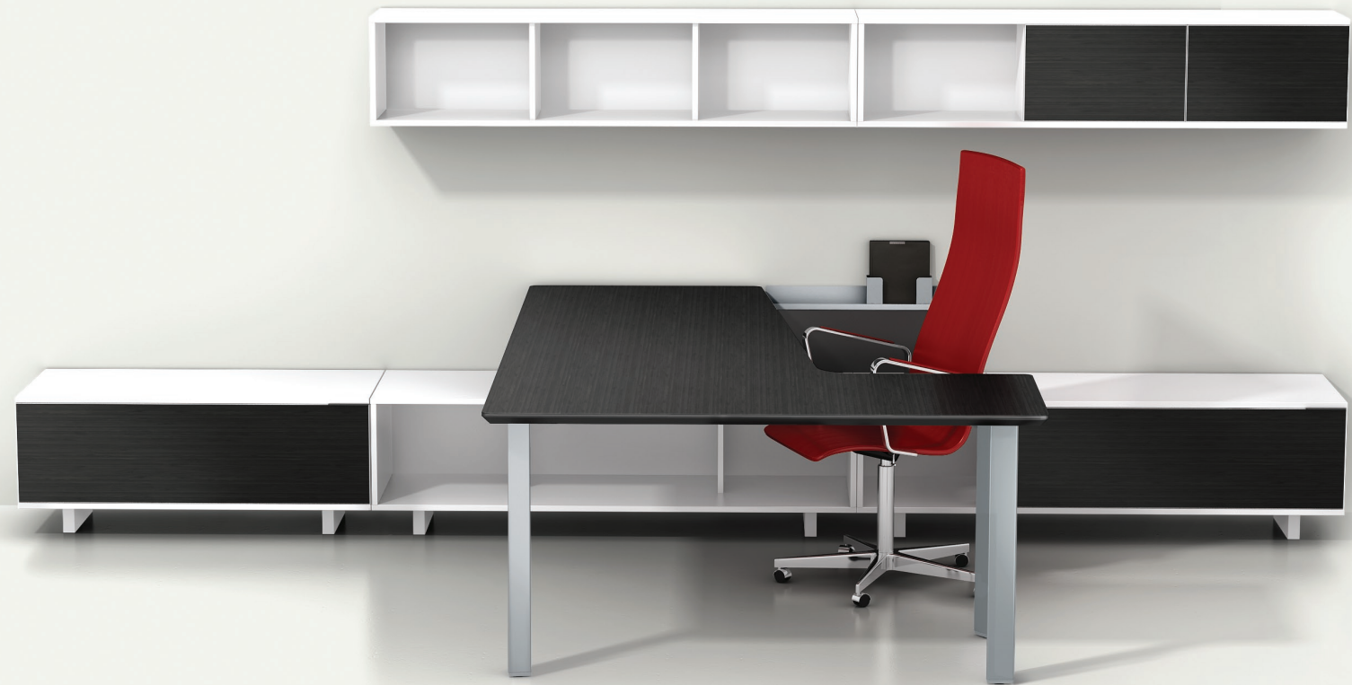
OVERHEAD (Open), OVERHEAD (Closed), 48x78 DESK, LEDGEWALL, CREDENZA (Top Access), CREDENZA (Open), CREDENZA (Top Access)