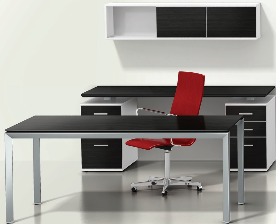
INTEGRATED COLLECTION: OVERHEAD (M2/O), CREDENZA DESK (M2), VIGA DESK (Miro)