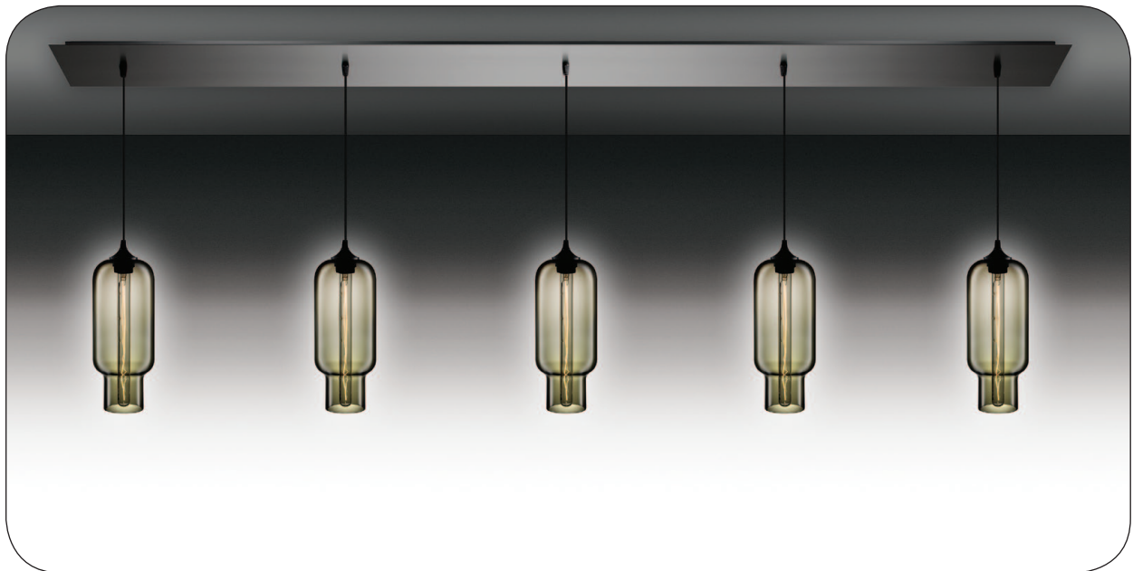
LINEAR-5 CANOPY IN BRUSHED STAINLESS WITH PHAROS GLASS IN SMOKE