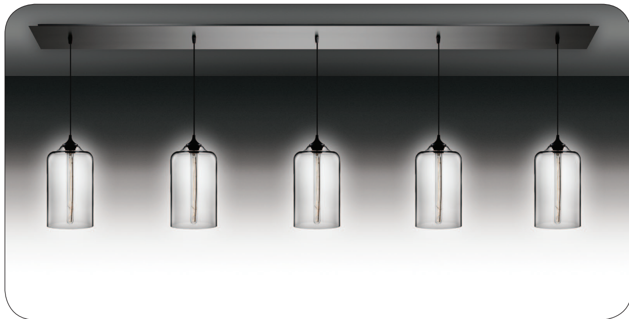
LINEAR-5 CANOPY IN BRUSHED STAINLESS WITH BELLA GLASS IN CRYSTAL