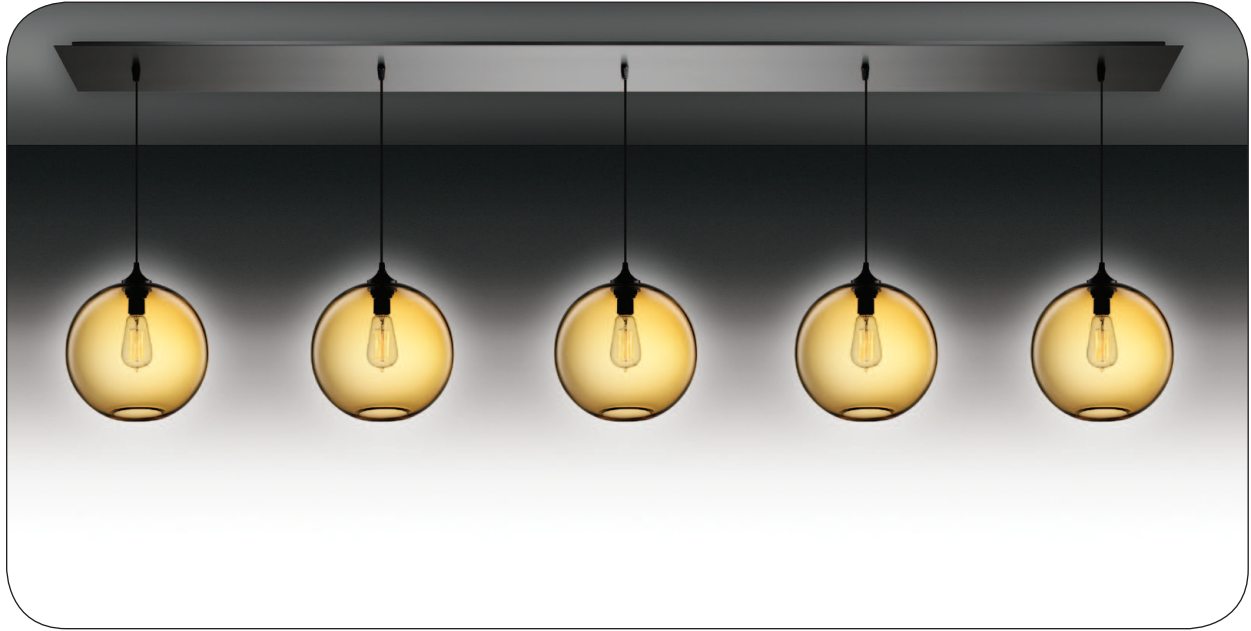
LINEAR-5 CANOPY IN BRUSHED STAINLESS WITH SOLITAIRE GLASS IN AMBER