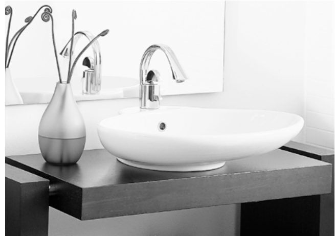
Shown with Iperbole faucet (5131.101.002) Shown on Kyomi Console (Model #30170)

Fixture Dimensions conform to ASME Standard A112.19.9