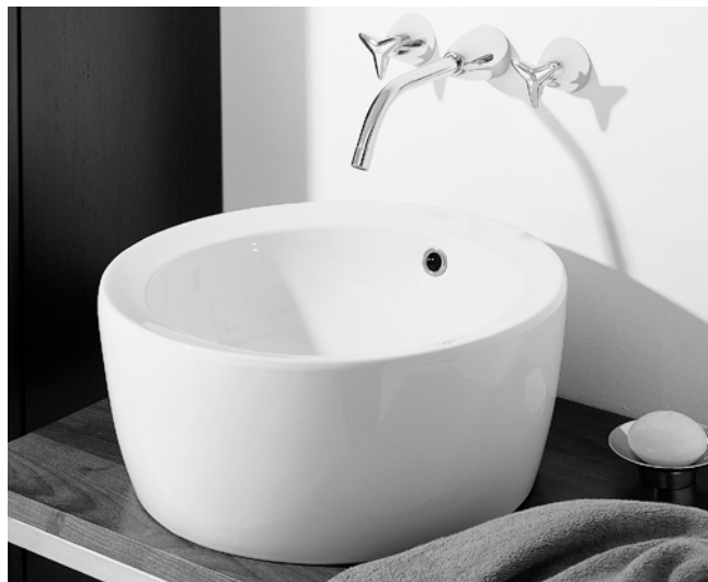
Shown with Stemma faucet (5339.451.002)

Fixture Dimensions conform to ASME Standard A112.19.9