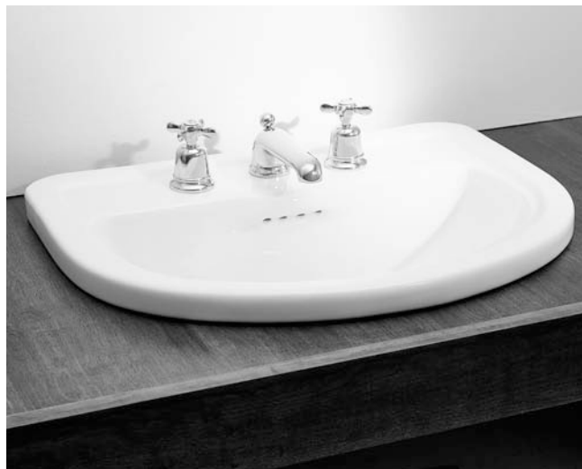
Shown with Archive faucet (5414.801)

Fixture Dimensions conform to ANSI Standard A112.19.2M