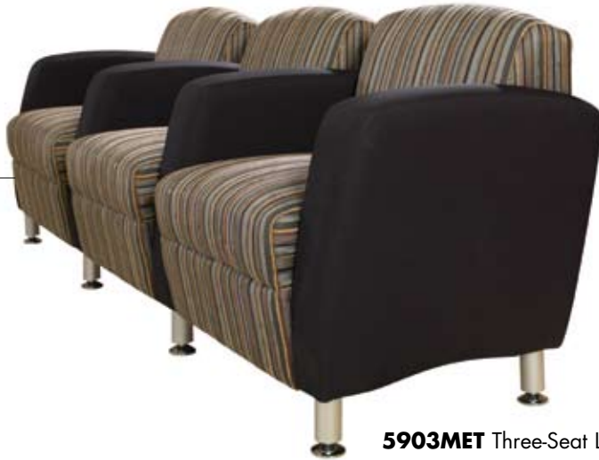
5903MET Three-Seat Lounge