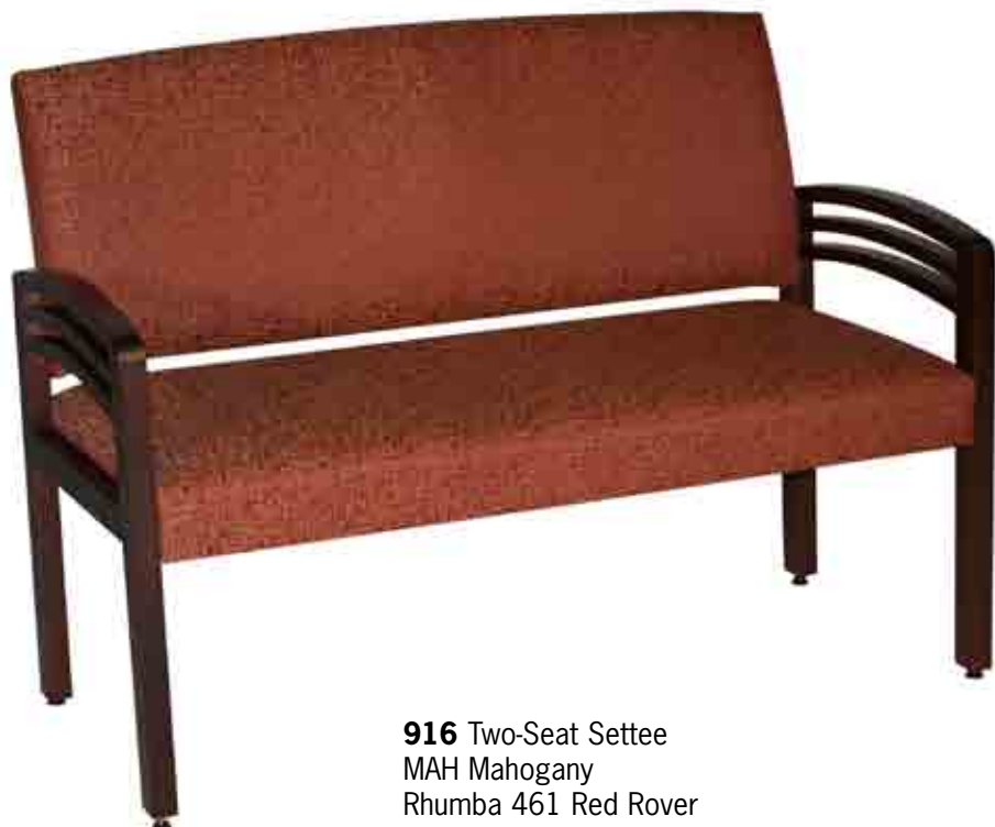
916 Two-Seat Settee MAH Mahogany Rhumba 461 Red Rover

The Trados collection offers armchairs, settees, benches, high-back patient chairs, hip chairs and bariatric seating. All seating units, corner and connecting tables can be ganged in a virtually unlimited number of combinations.