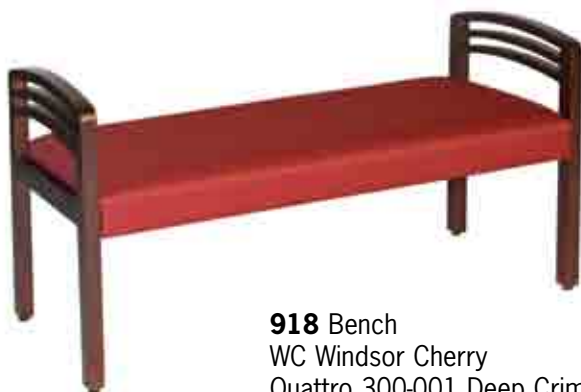
918 Bench WC Windsor Cherry Quattro 300-001 Deep Crimson