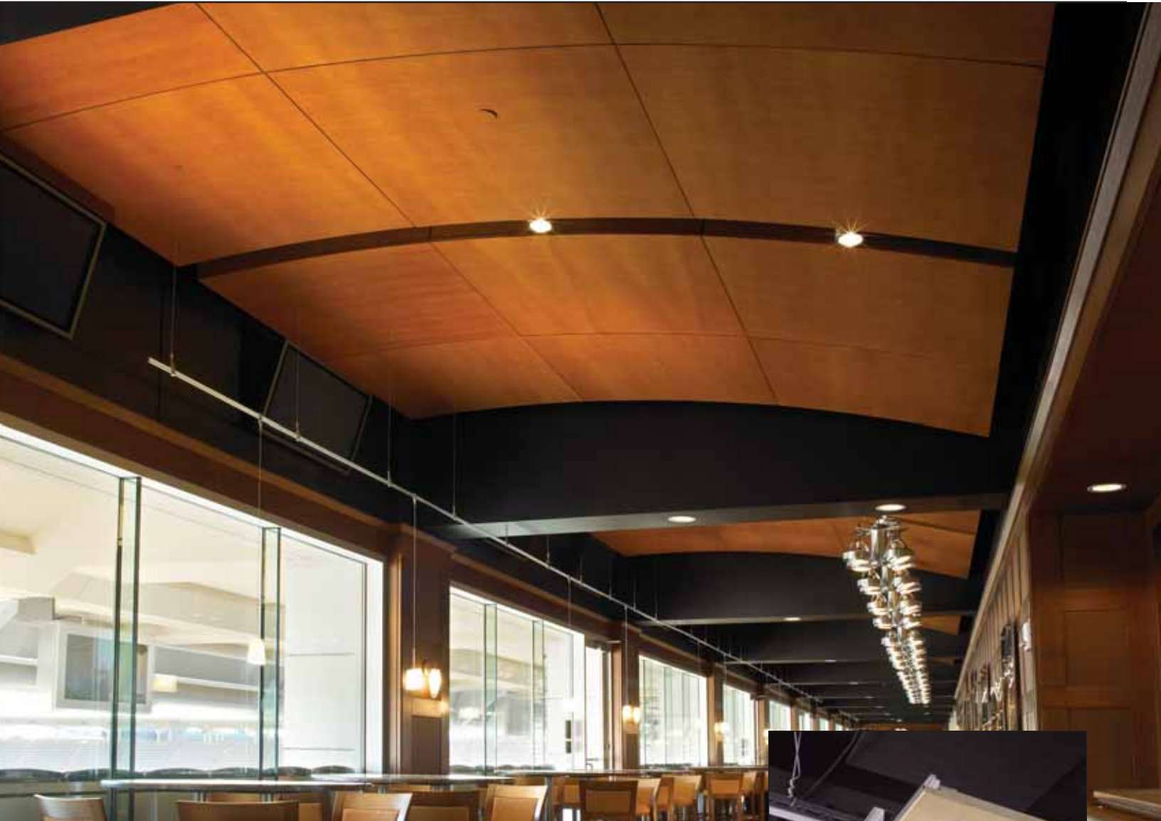
WOODWORKS Access Custom Curved Ceiling