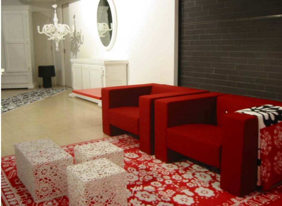
Moooi Showroom London, UK.