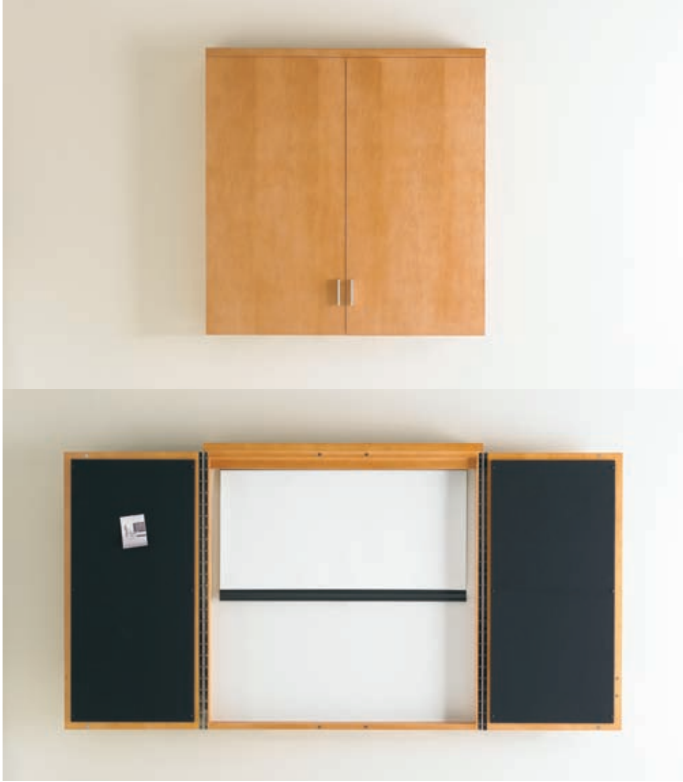
05 Wall mounted presentation cabinets with optional crown moulding feature hinged wood doors, white marker board, pull down projection screen and fabric covered tackable surfaces on the inside of each door.