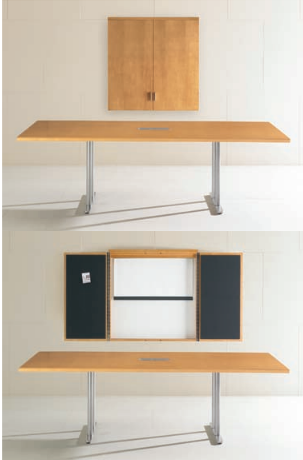
01 Ashton 960W x 48OD conference table with metal I-bases to incorporate wire management for power/data access. Wall mounted presentation cabinets increase the functionality of any conference area.

HBF introduces Ashton, Mercer and Fairmont conference products as a complement to the highly successful Casgood series by the same name. Solid, thoughtful proportion and attentive detailing offer the user an elegant and timely aesthetic solution. The three series are designed to address the reality of today's furniture budget restraints yet offer the hand-matched veneers, beautiful finishes, functionality and quality craftsmanship synonymous with HBF.