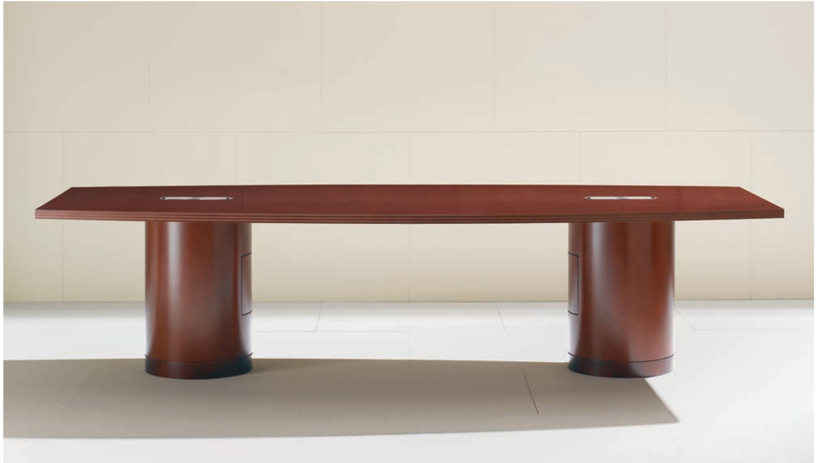
09 This Fairmont boat-shaped conference table with wood column bases is finished in HBF 06 Amber Cherry on maple. Ashton, Mercer and Fairmont conference tables are available in a number of shapes, multiple sizes, wood or metal bases, with or without power/data connections and a choice of wood veneers.