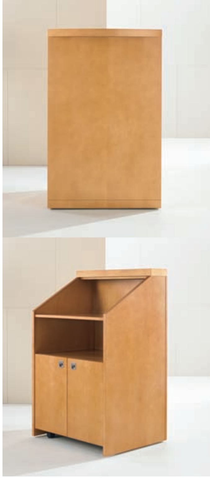
03 Lecterns, with a choice of three edge details, provide a functional addition to enhance the versatility of the more formal conferencing area. Open shelves and enclosed cabinet provide storage for presentation materials.