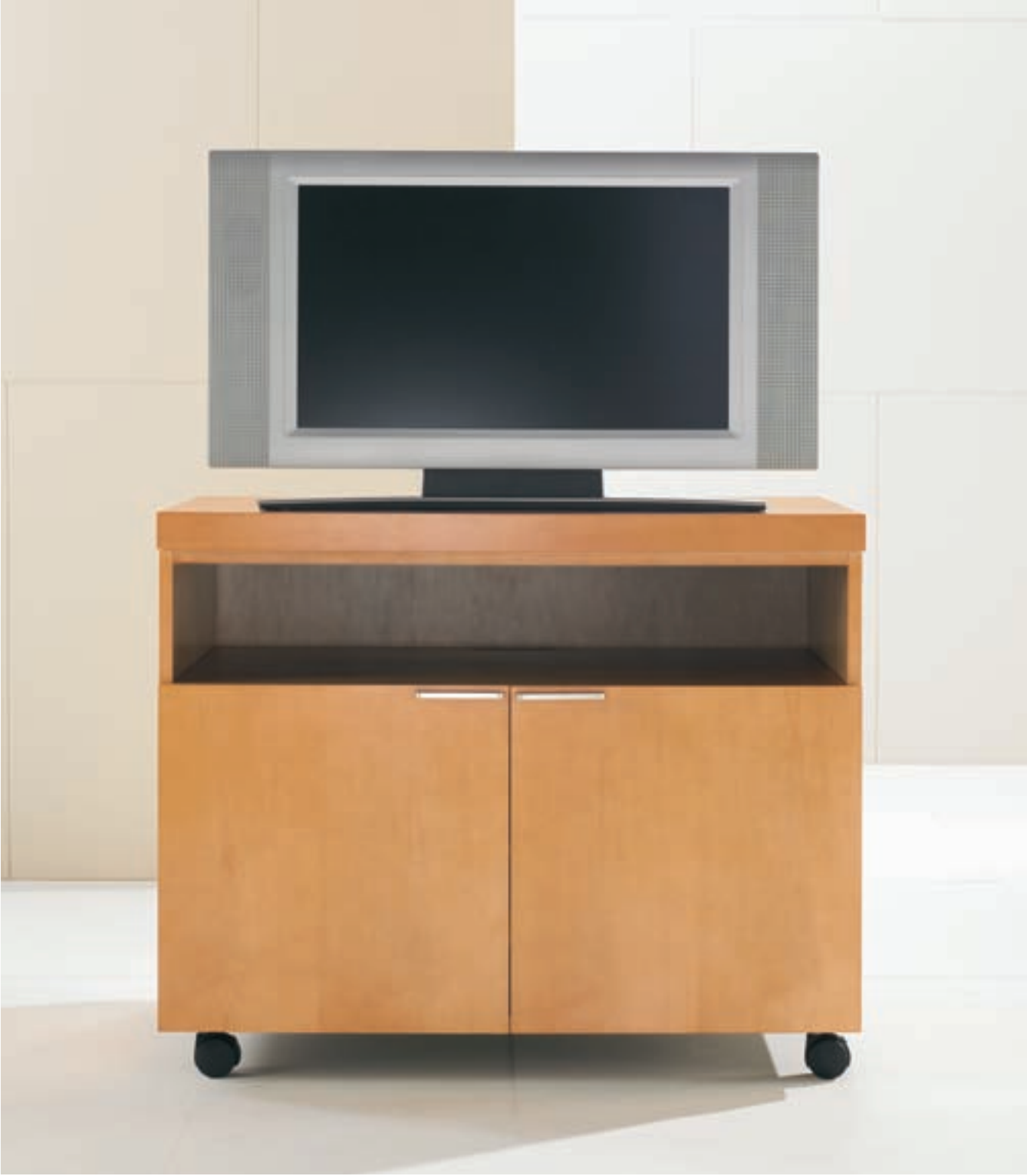
06 Mobile cabinetry addresses the versatile functionality required for group work environments. The audio/video cart features open and closed storage capabilities and is available with power/data communication access.