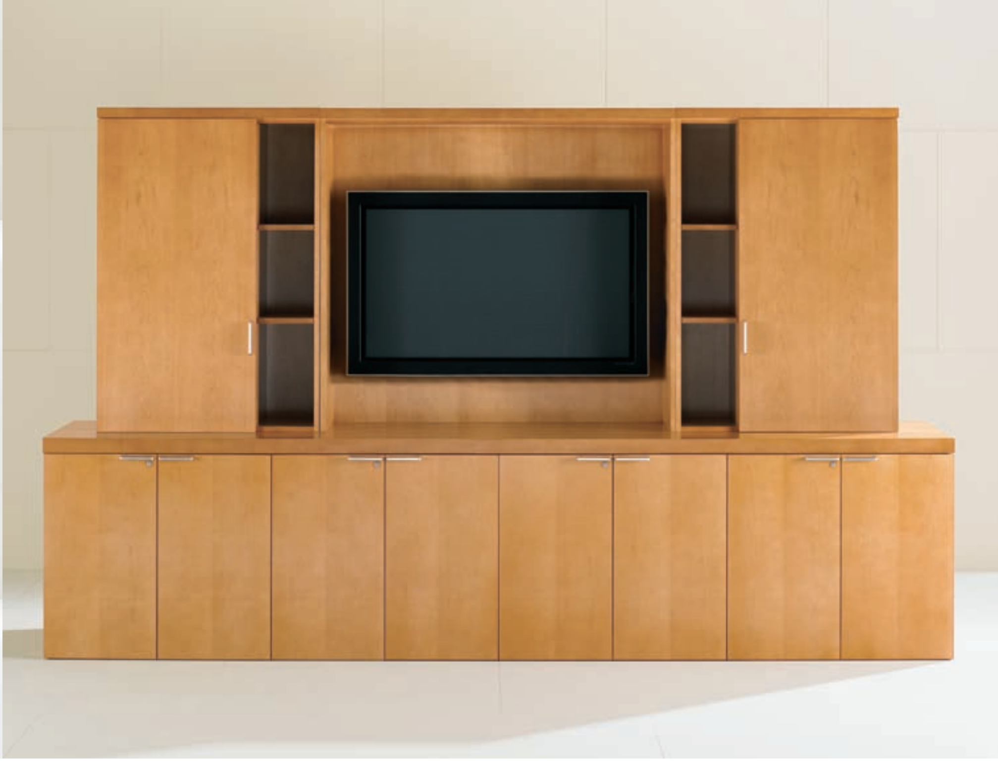
04 The Ashton Mercer Fairmont Conference Series features a comprehensive offering of conferencing cabinetry that provides flexible components to address the requirements of today's meeting and conference environments.