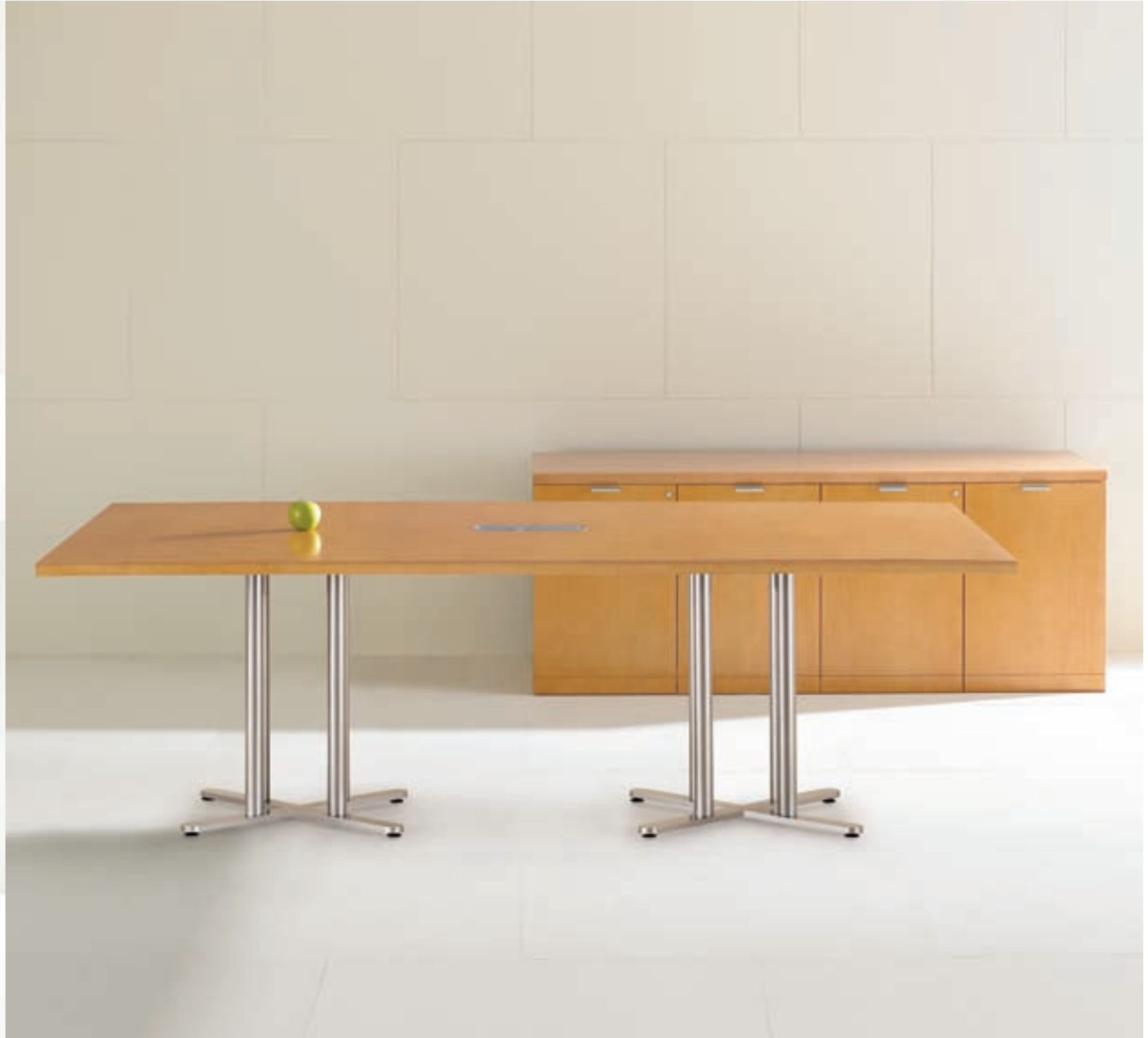
02 This rectangular Ashton conference table, finished in HBF 12 Wheat on maple, is supported by two satin pewter X-bases with wire management channel. The oval power/data unit offers four electrical outlets and up to six field-changeable data connections. The four-door credenza with interior adjustable shelves provides ample storage for the meeting space.