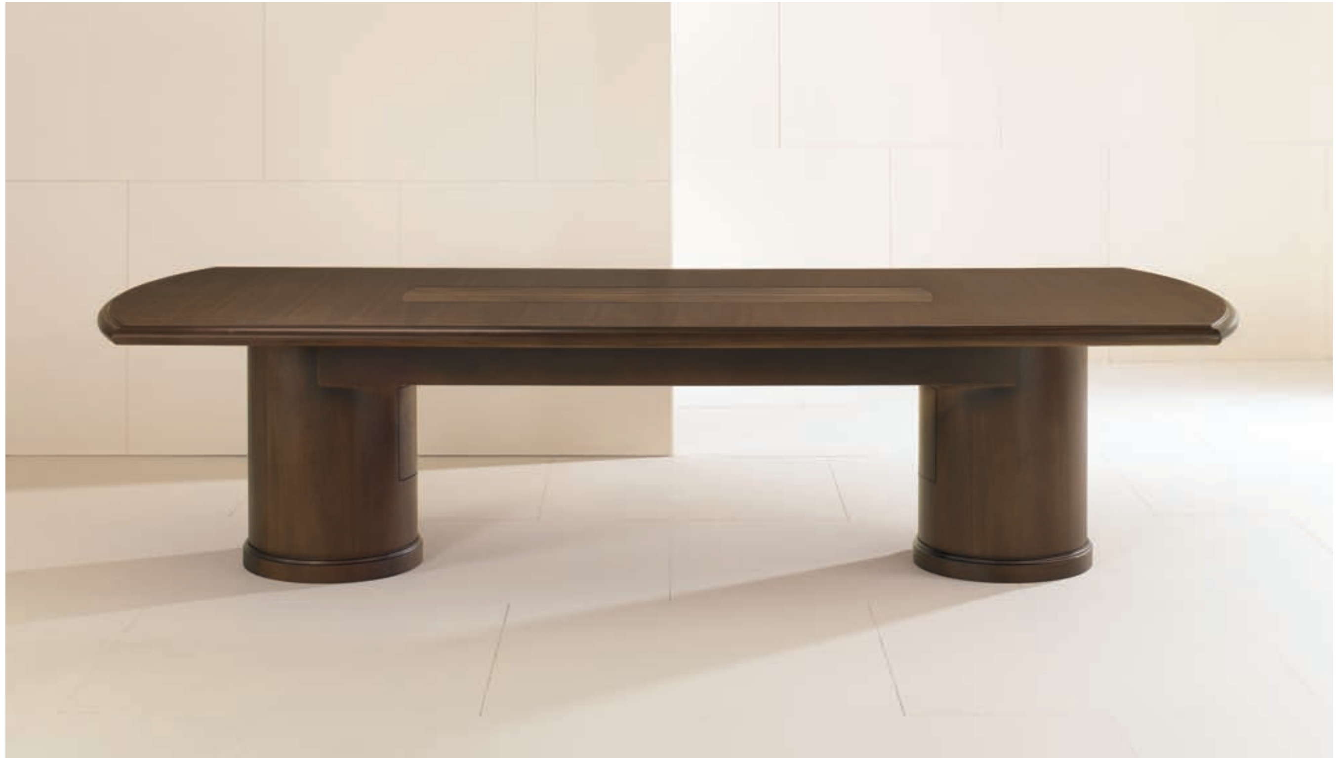
Chamberlain casegoods are complemented by an extensive group of conference products. This 48x120 conference table features the Brookford edge detail and incorporates power/data access. HBF Cocoa on walnut.