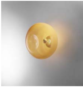
AMBER SMOKED W/ SILICA SAND DUST