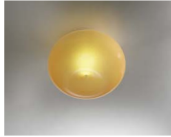
Satinato -AMBER SMOKED W/ SILICA SAND DUST W/ SMOKED INTERIOR