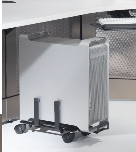
Mobile CPU Unit allows for easy mobility within the workstation.