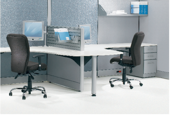
Cosmopolitan monolithic tiles are acoustical, tackable and seamlessly integrate with Cosmopolitan's entire product offering.

Cosmopolitan monolithic panel. Minimum cost. Maximum appeal.