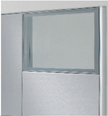
Glazed tiles in 8, 16, and 24-inch heights increase visibility and provide access to natural light.