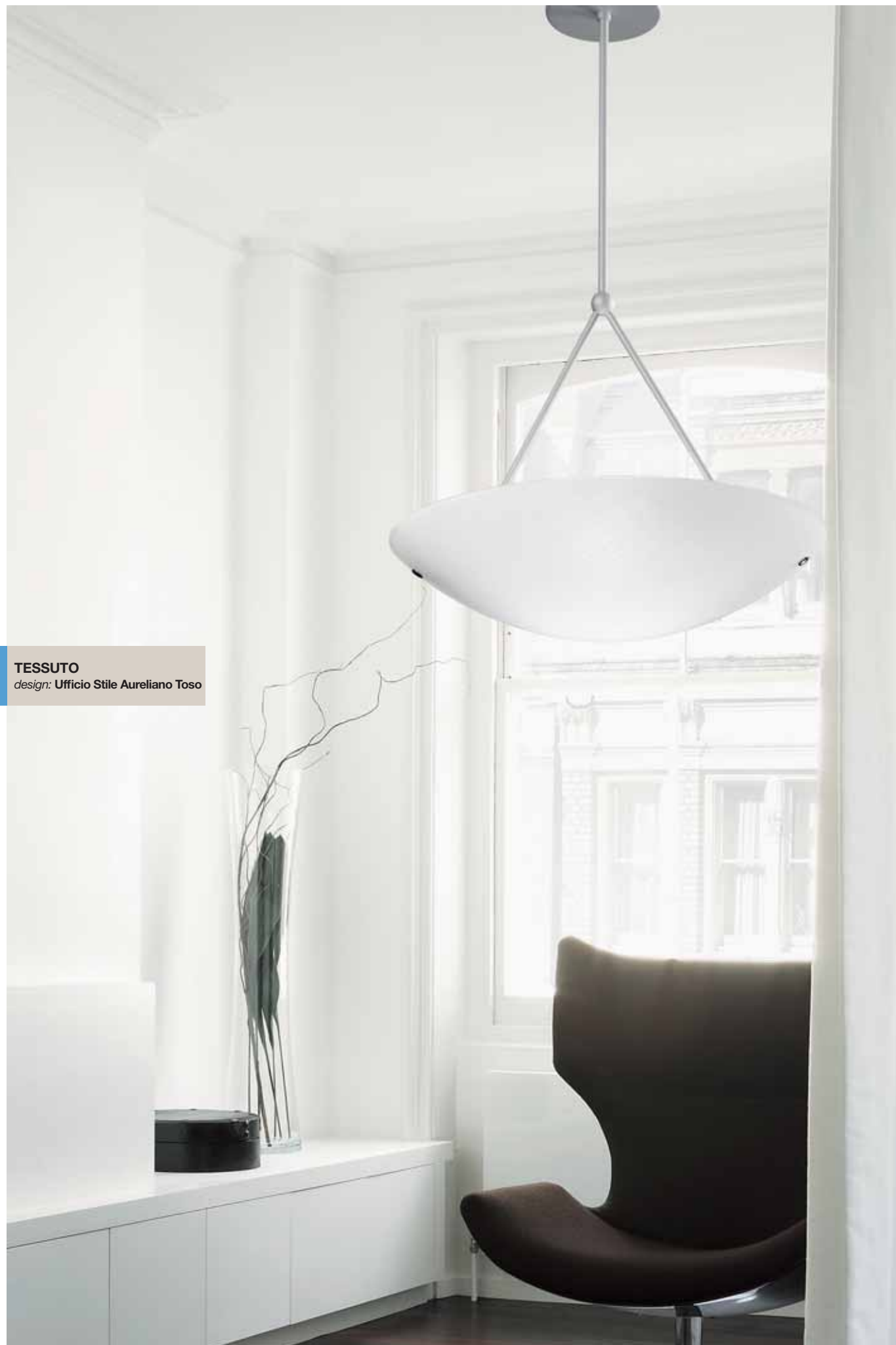
TESSUTO design: Ufficio Stile Aureliano Toso