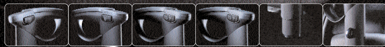
Seat Height Adjustment (Right) Tilt Angle Adjustment (Left) Back Angle Adjustment (Left) Multi-tilter only Tilt Angle Adjustment (Left) Multi-tilter only Arm Width Adjustment Arm Height Adjustment