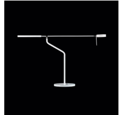
Table lamp. Structure in brass, base and ballast in zamac metal alloy. Parabola in resin. Available painted aluminium (A), matt white (BI), chrome-plated (CR) and dark grey (GS). Two patent pending joints situated in the base and on the arm allow the appliance to be rotated 300°. The head, 360° adjustable, allows the lighting beam to be orientated in all the directions. Design patent pending