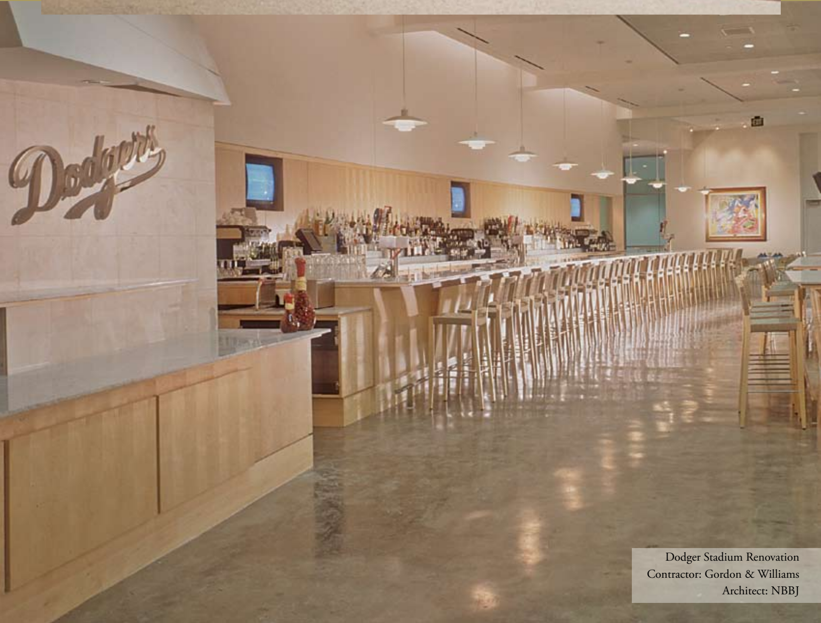
Dodger Stadium Renovation Contractor: Gordon & Williams Architect: NBBJ