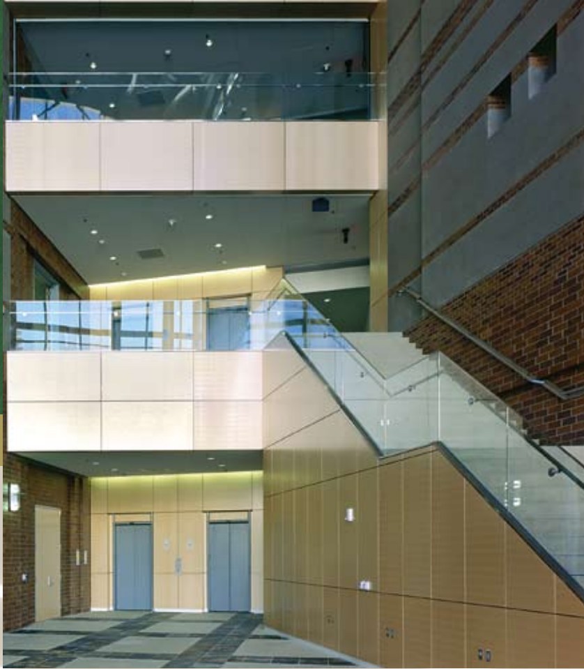
UCI-Calit2 Building Contractor: PCL Construction Services, Inc. Architect: Leo A. Daly