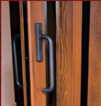
All wood panel, with cylindrical handle in oil-rubbed bronze finish.