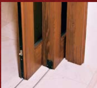
The flush stainless-steel track projects only 3/16" above the finished floor, for a nearly seamless transition.