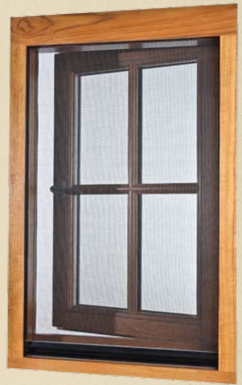
Push-out casement with screen pulled down