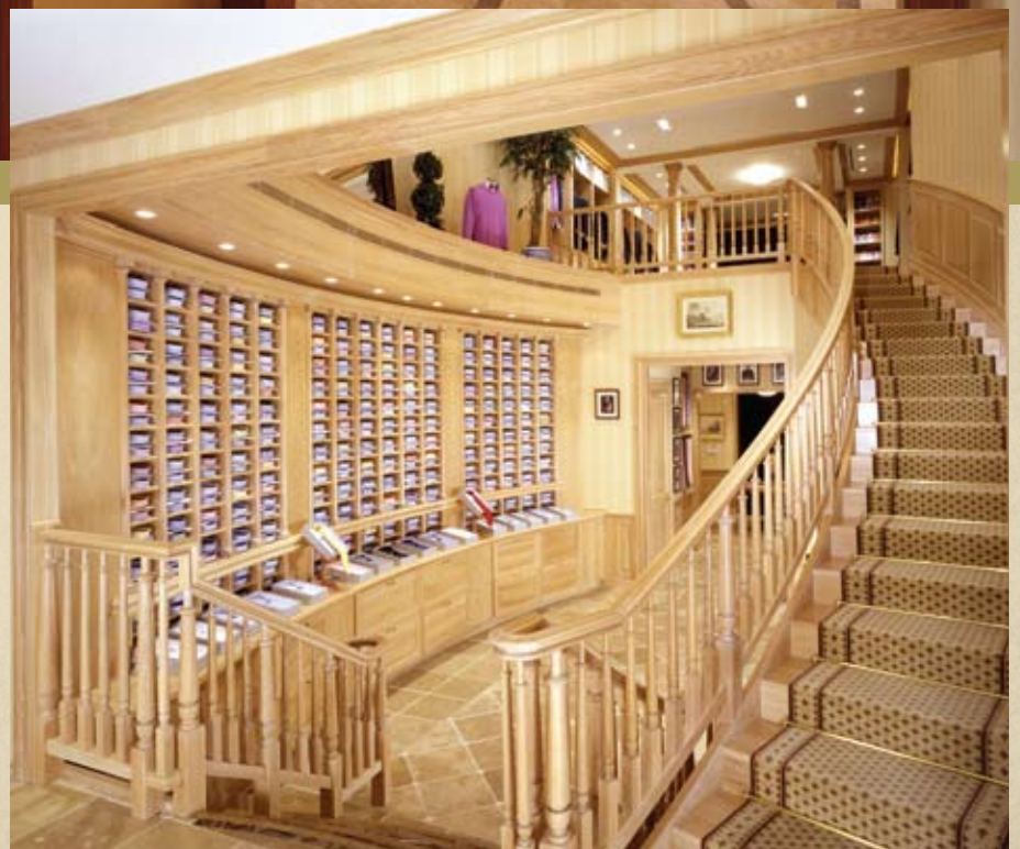
Turnbull & Asser Retail Store – Beverly Hills, CA Contractor: Illig Construction Co. Architect: Gabbay Architects

Pacific has fabricated and installed millwork for diverse project types, including hotels, executive offices, restaurants, religious institutions, courthouses, retail, and schools and universities. We can also re-create historical details and match existing products when required.