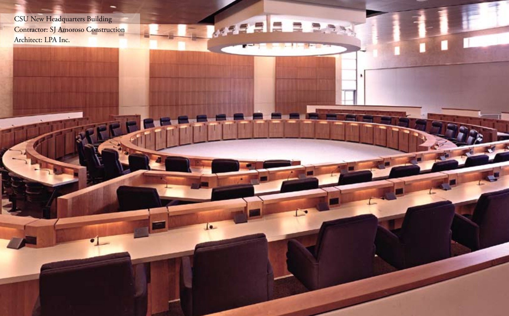
CSU New Headquarters Building Contractor: SJ Amoroso Construction Architect: LPA Inc.