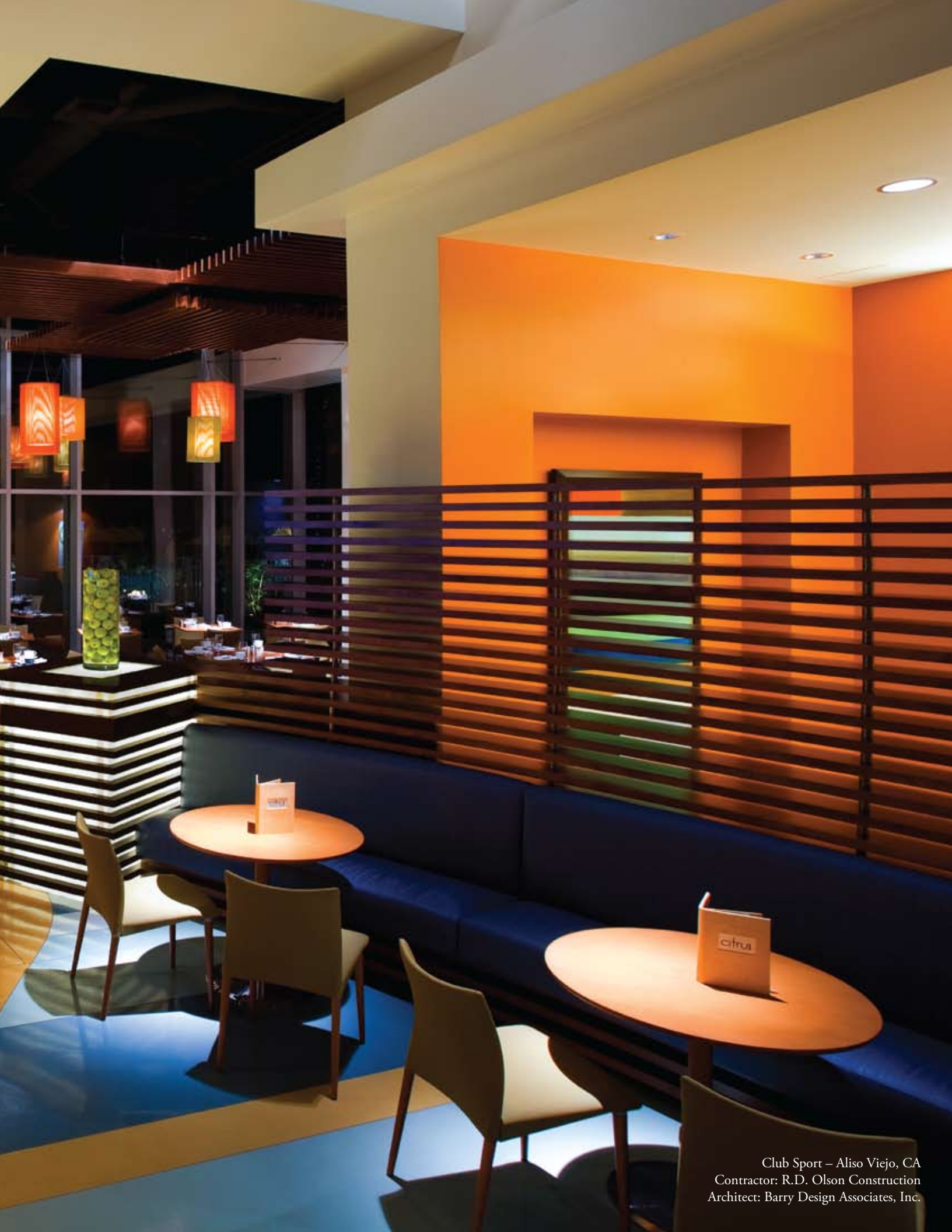
Club Sport – Aliso Viejo, CA Contractor: R.D. Olson Construction Architect: Barry Design Associates, Inc.