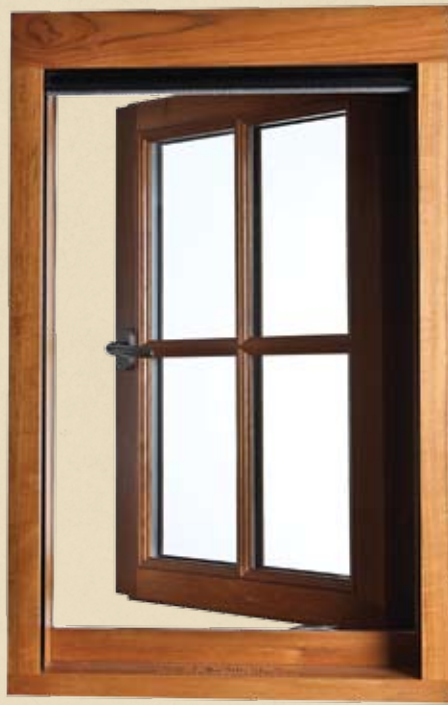
Push-out casement with screen retracted

Pacific offers standard push-out hardware for easy operation and elegant lines, versus typical roto-mech handles. Screens are also available in a variety of styles, including hinged wood-panel screens, fixed aluminum screens, or concealed pull-down screens that roll up and out of sight when not in use.