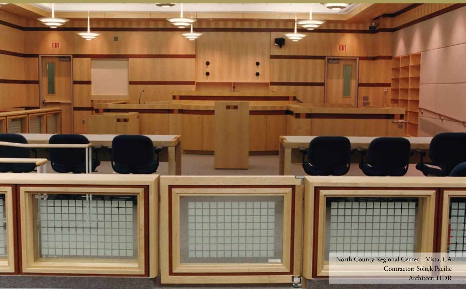
North County Regional Center – Vista, CA Contractor: Soltek Pacific Architect: HDR