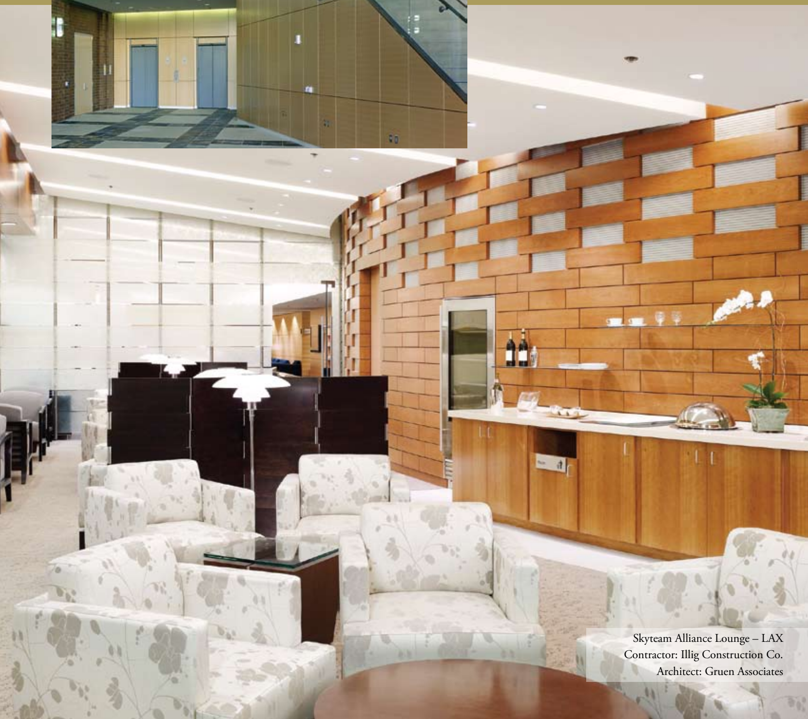
Skyteam Alliance Lounge – LAX Contractor: Illig Construction Co. Architect: Gruen Associates