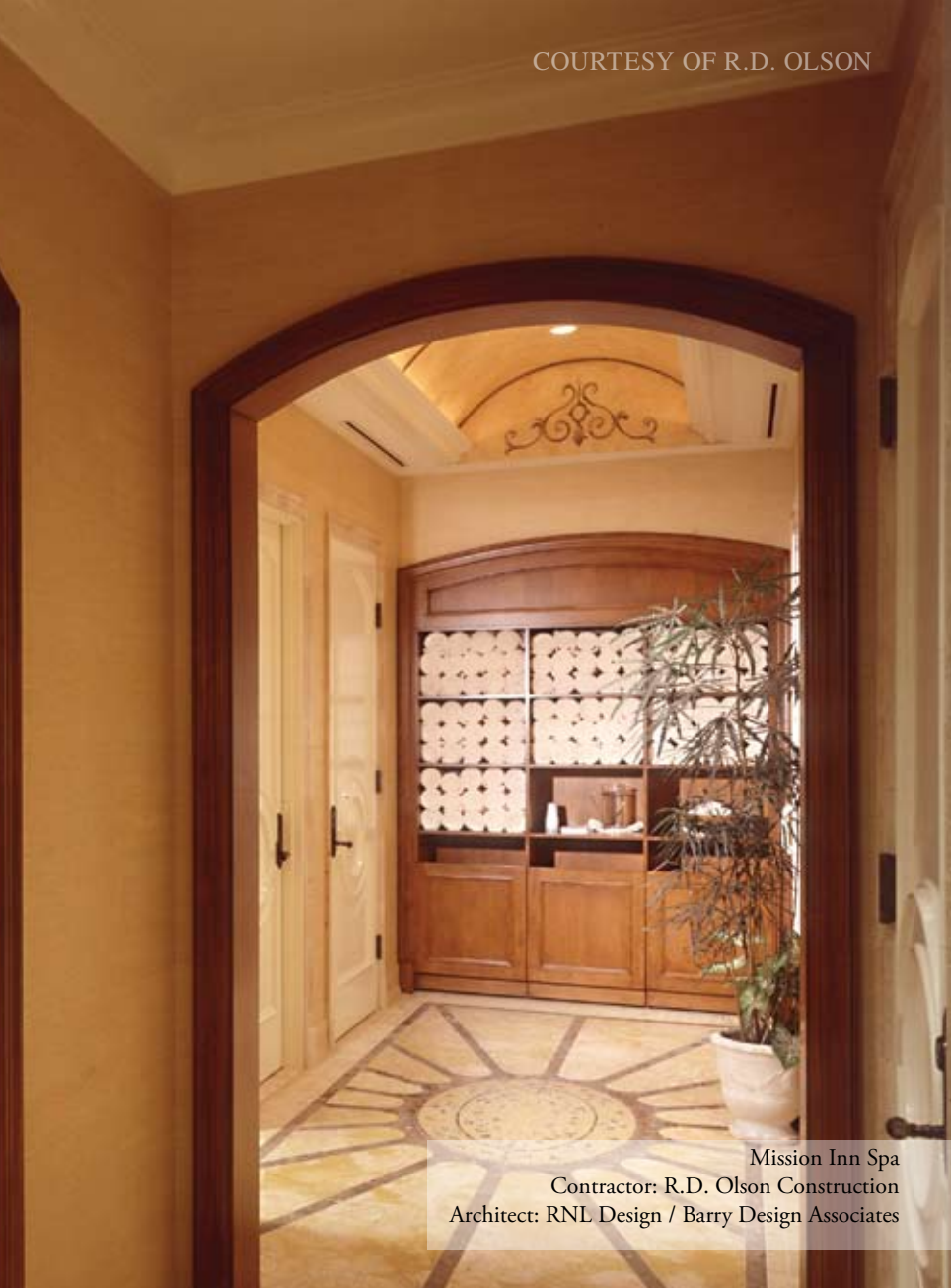
Mission Inn Spa Contractor: R.D. Olson Construction Architect: RNL Design / Barry Design Associates

Pacific has fabricated and installed millwork for diverse project types, including hotels, executive offices, restaurants, religious institutions, courthouses, retail, and schools and universities. We can also re-create historical details and match existing products when required.