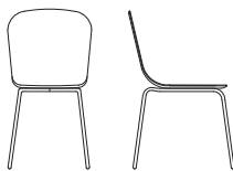
APPLE SIDE CHAIR

W 20 3 / 4 "(53cm) . D 21 3 / 4 "(55cm) . H 31"(79cm) . SH 18"(46cm)