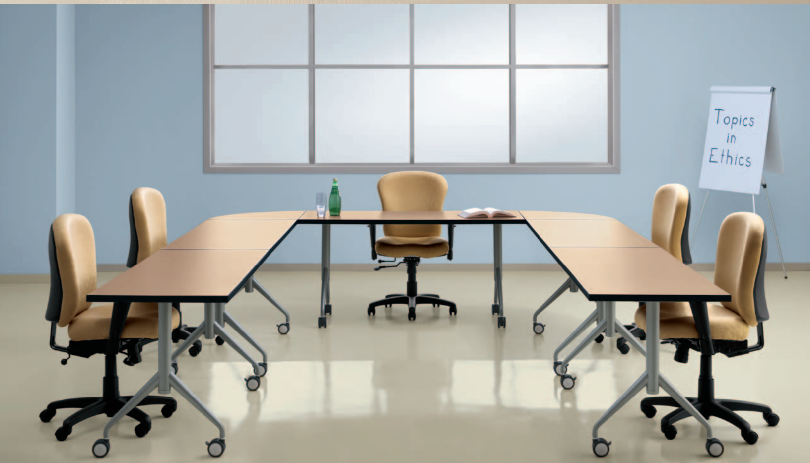
6 Trek table with Impress™ task chair ( education )