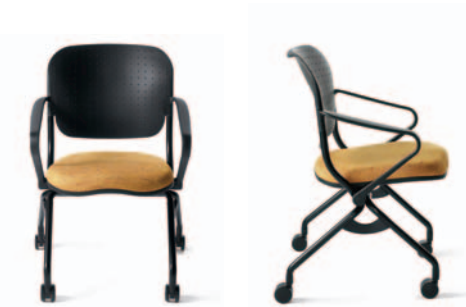
Torsion on the Go!