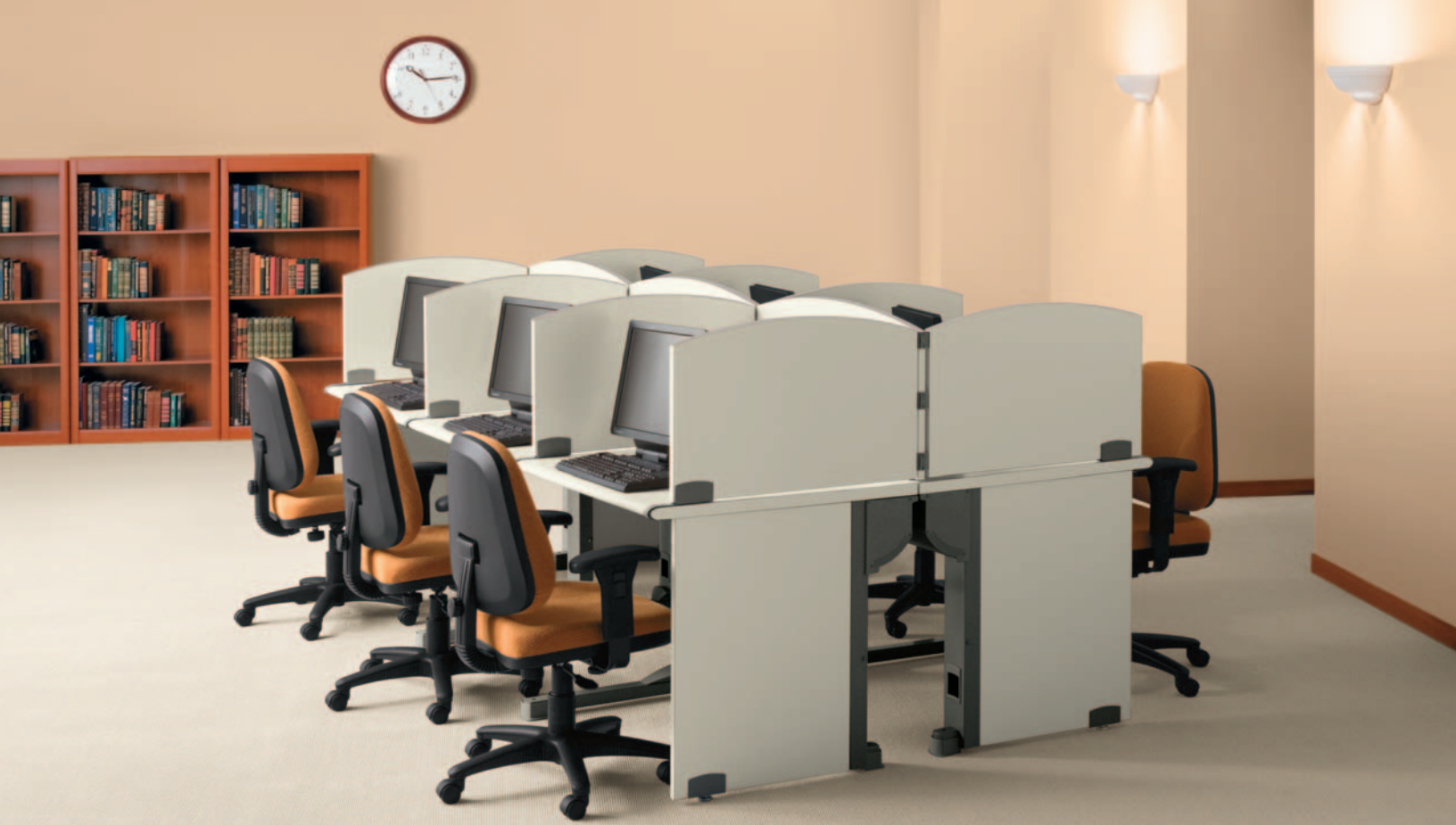
PowerComm table with Kismet® task chair ( library )