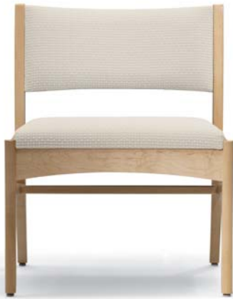
309-OB91, Bariatric Chair