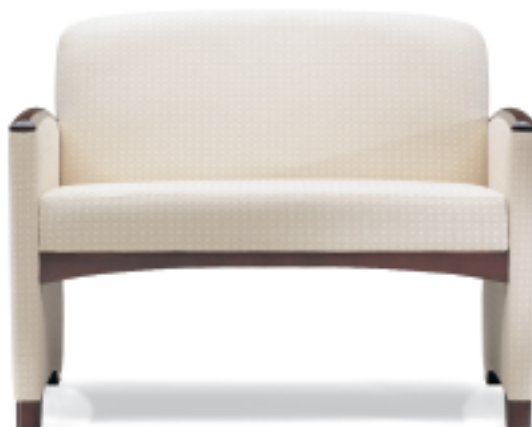
BDYLAW-0B40, Bariatric Chair