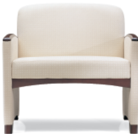
BDYLAW-0B30, Bariatric Chair