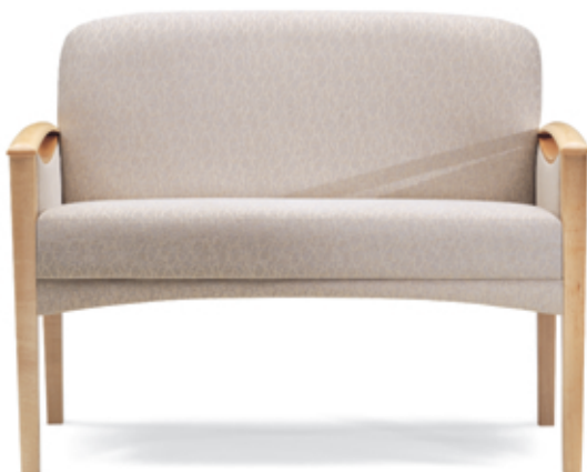
BUYOAX-0B40, Bariatric Chair