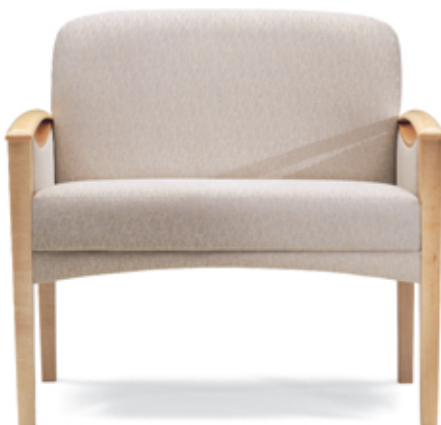
BUYOAX-0B30, Bariatric Chair