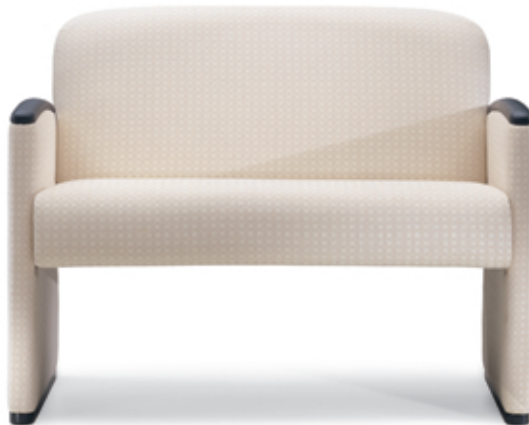
23GWS-0B40, Bariatric Chair