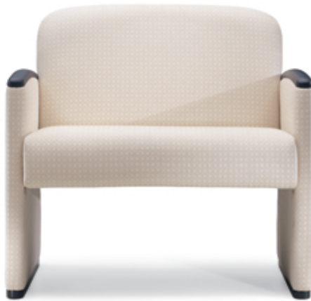
23GWS-0B30, Bariatric Chair