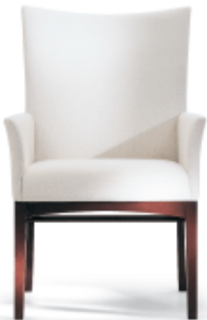
740-51, Patient Highback