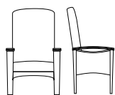
Small Uptown Highback, SUCOBW-51