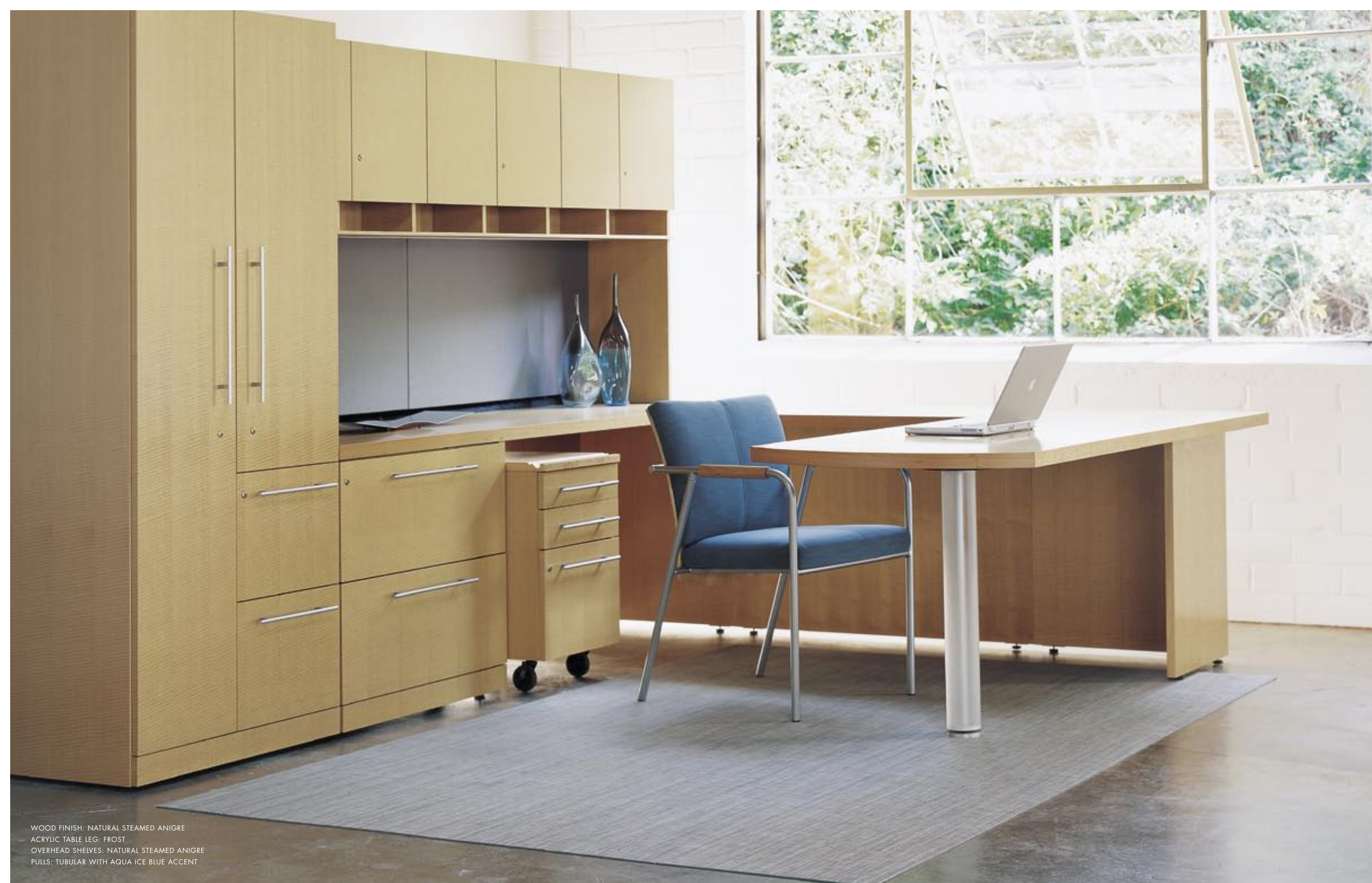
WOOD FINISH: NATURAL STEAMED ANIGRE ACRYLIC TABLE LEG: FROST OVERHEAD SHELVES: NATURAL STEAMED ANIGRE PULLS: TUBULAR WITH AQUA ICE BLUE ACCENT