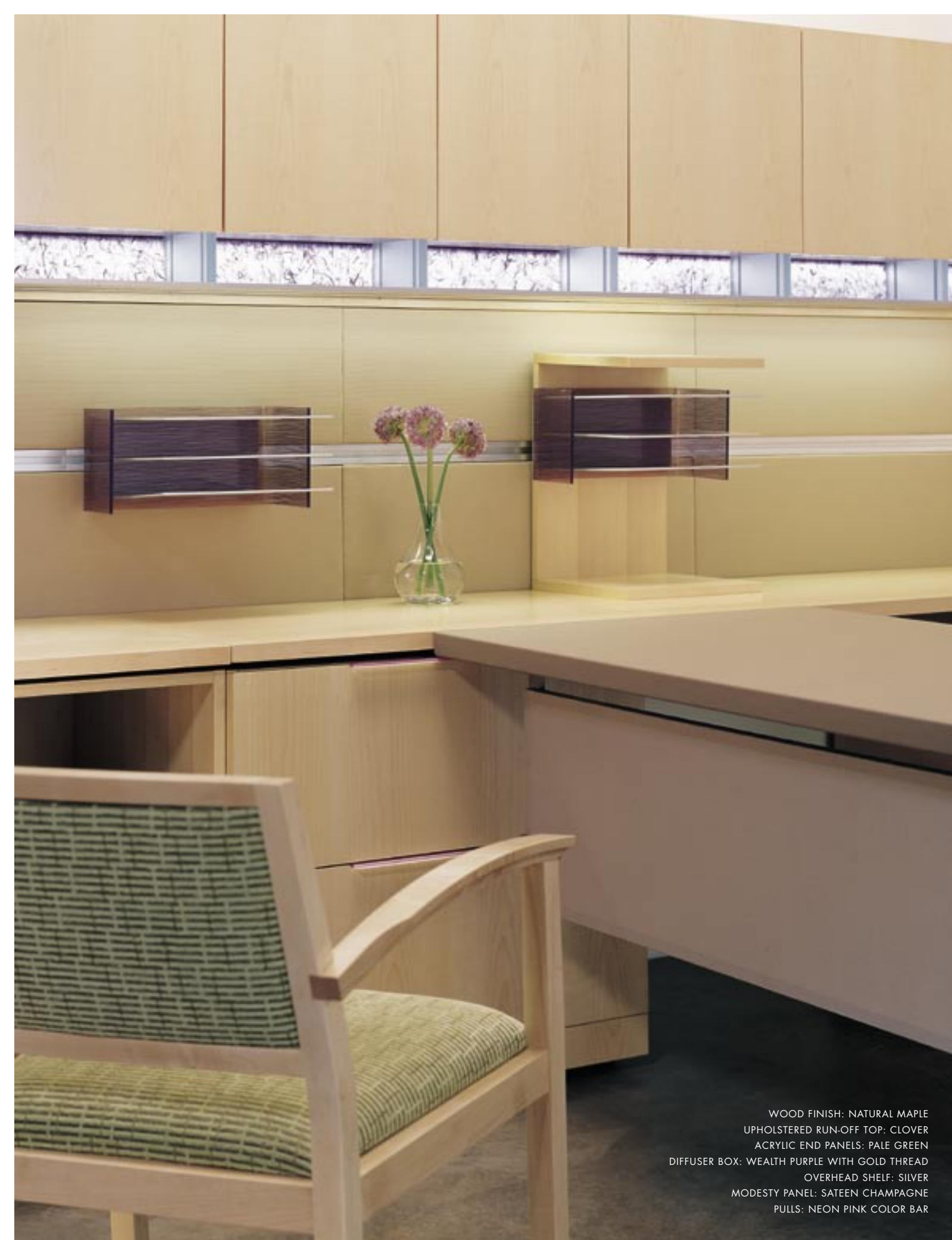
WOOD FINISH: NATURAL MAPLE UPHOLSTERED RUN-OFF TOP: CLOVER ACRYLIC END PANELS: PALE GREEN DIFFUSER BOX: WEALTH PURPLE WITH GOLD THREAD OVERHEAD SHELF: SILVER MODESTY PANEL: SATEEN CHAMPAGNE PULLS: NEON PINK COLOR BAR