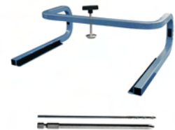
PI Mounting Clamp Driver & Drill Bit (IK0011)