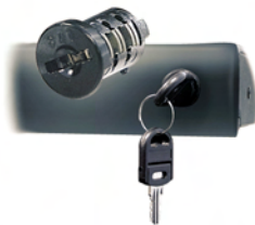
Lock Core & Two Keys (HW0021)