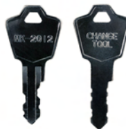
Master Key & Change Tool (HW0018) (HW0017)