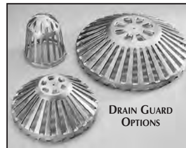
DRAIN GUARD OPTIONS