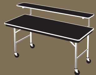
BAR/BUFFET TABLE 1 TOPSHELF