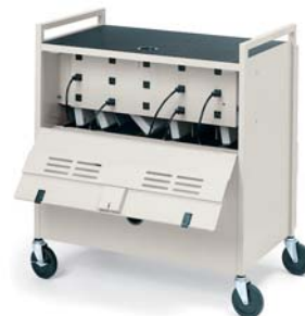
THE BACK OF THE UNIT OPENS FOR EASY ACCESS TO THE ELECTRICAL UNIT.

LAP series laptop storage carts are made at Bretford's Chicago area manufacturing facility using union labor.