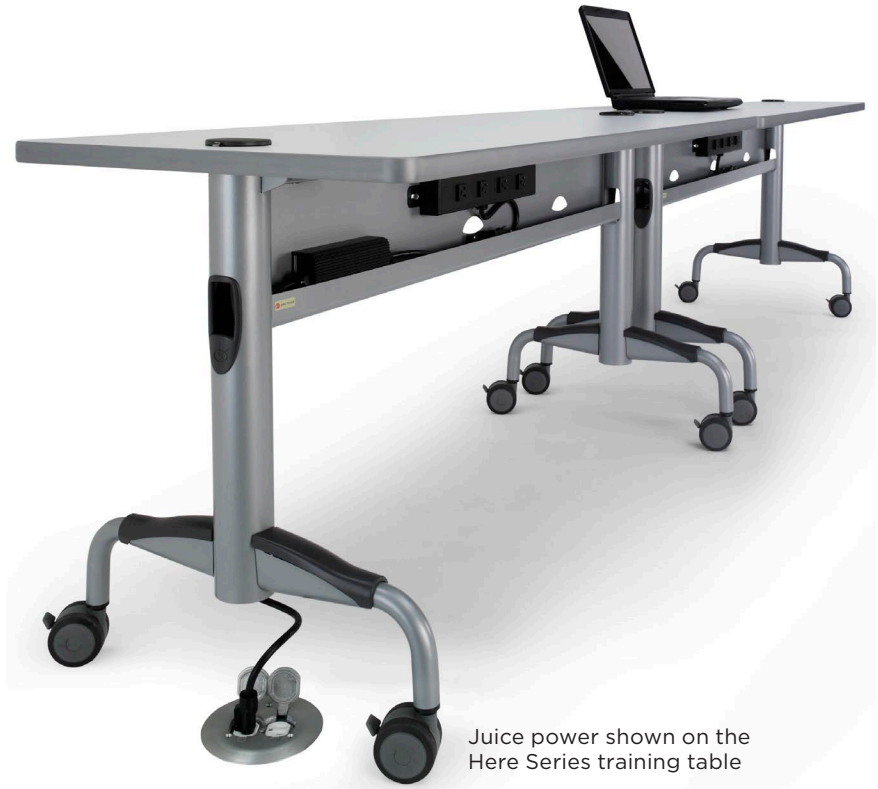
Juice power shown on the Here Series training table