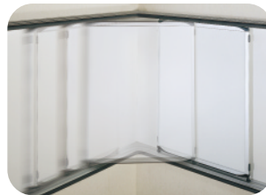
Innovative rail and corners allow boards and screen to roll from wall to wall around 90° corners.