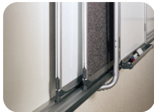
Write-on Dry Erase Wall Covering plus 3 layers of presentation boards provide flexibility and mobility.