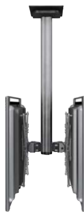
FPCM-2-AL and FPCMPOLE60

NOTE: Always use a professional installer when mounting TV monitors. Warranties and UL listings are void when improperly installed.