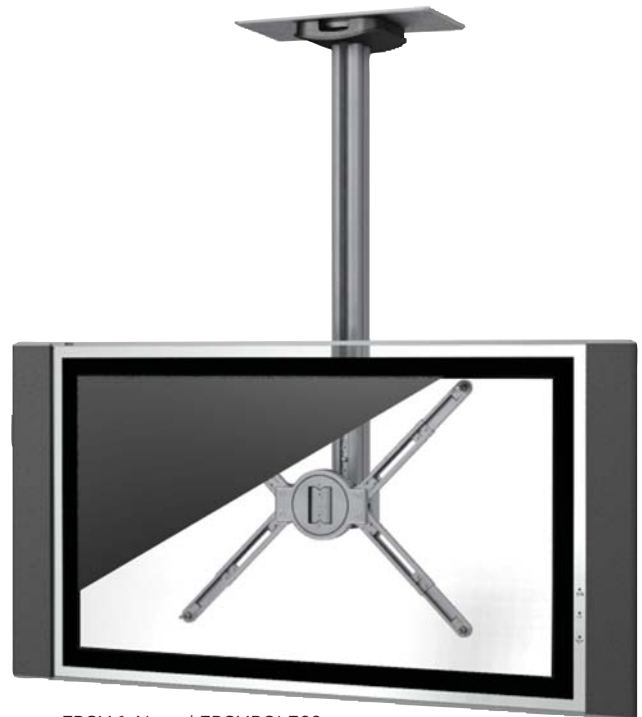
FPCM-1-AL and FPCMPOLE60

NOTE: Always use a professional installer when mounting TV monitors. Warranties and UL listings are void when improperly installed.