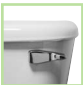
31501 Right hand trip lever

This fixture qualifies according to ASME test procedures as a high efficiency toilet (HET) with an average consumption of 1.1 gpf / 4.0 lpf or less with a minimum water savings of 20%.