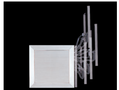
*SLUH (short arm version) available for shorter doors.