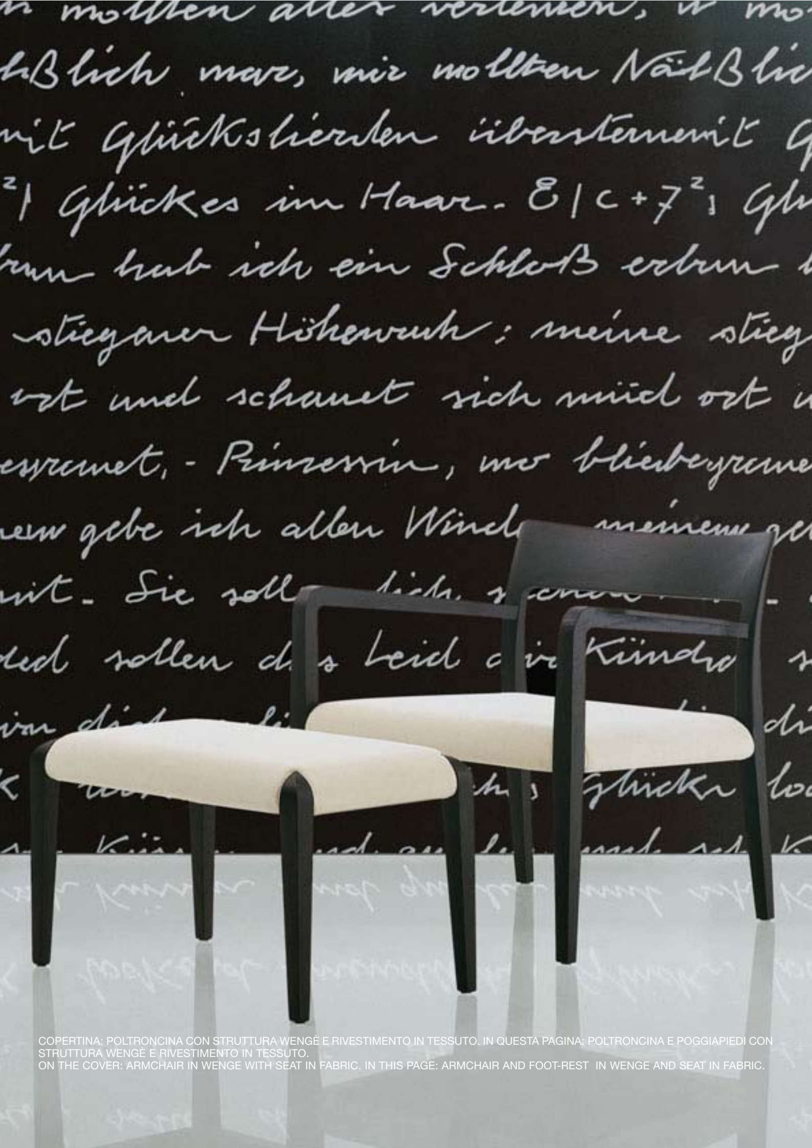
COPERTINA: POLTRONCINA CON STRUTTURA WENGÈ E RIVESTIMENTO IN TESSUTO. IN QUESTA PAGINA: POLTRONCINA E POGGIPIEDI CON STRUTTURA WENGÈ E RIVESTIMENTO IN TESSUTO. ON THE COVER: ARMCHAIR IN WENGÈ WITH SEAT IN FABRIC. IN THIS PAGE: ARMCHAIR AND FOOT-REST IN WENGÈ AND SEAT IN FABRIC.