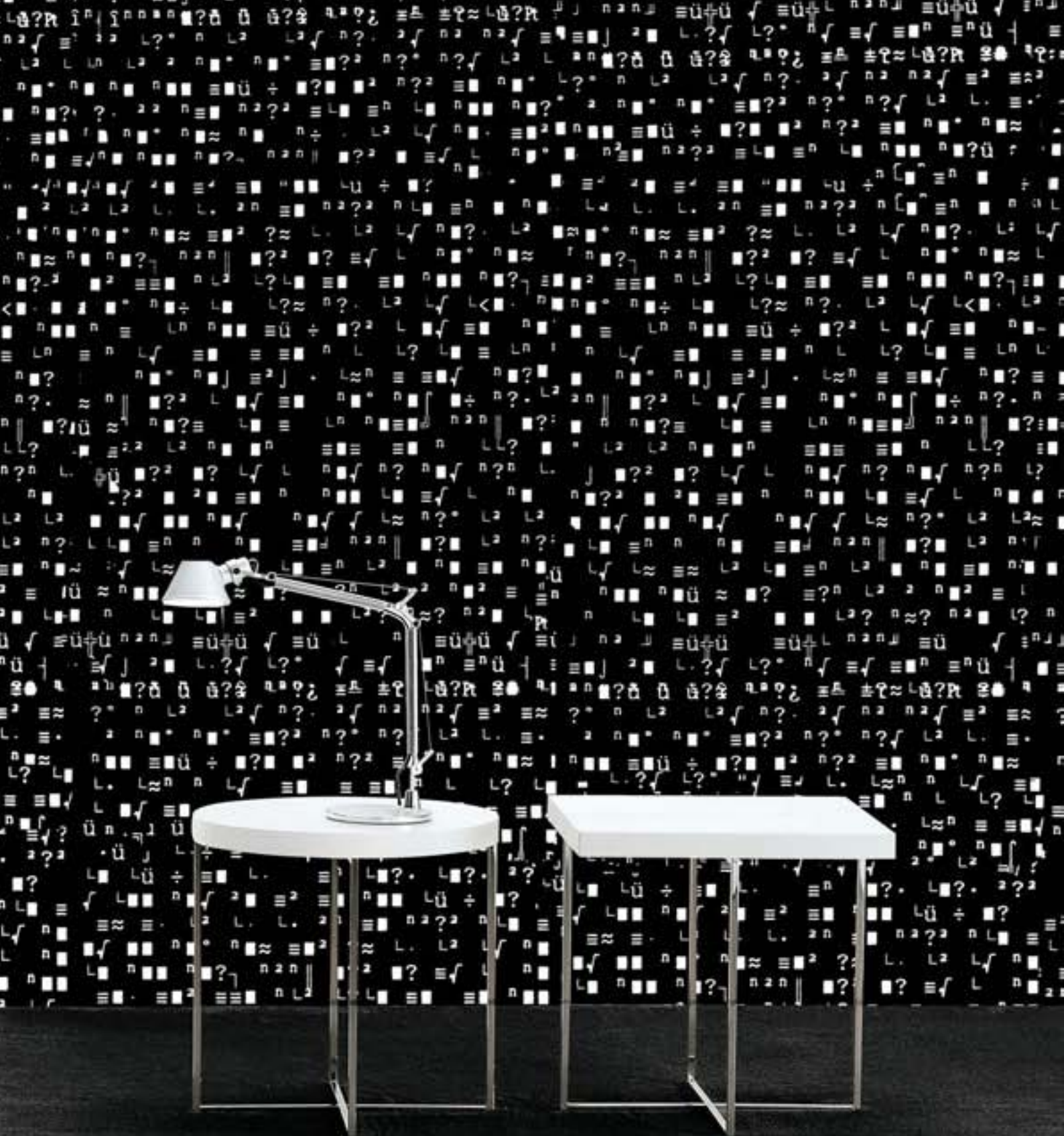
COPERTINA: A SINISTRA STRUTTURA CROMATA E PIANO IN CUOIO, A DESTRA STRUTTURA E PIANO WENGÈ. IN QUESTA PAGINA: A SINISTRA STRUTTURA E PIANO WENGÈ. A DESTRA STRUTTURA CROMATA E PIANO LACCATO LUCIDO BIANCO. ON THE COVER: ON THE LEFT CHROMED STRUCTURE AND TOP IN HIDE. ON THE RIGHT STRUCTURE AND TOP IN WENGÈ. IN THIS PAGE: ON THE LEFT STRUCTURE AND TOP IN WENGÈ. ON THE RIGHT CHROMED STRUCTURE AND TOP WHITE GLOSSY LACQUERED.