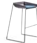
stool TS30702 with upholstered seat