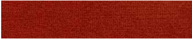
Samba (not available on Jenny)

Stain resistant, fluid barrier, anti-microbial, soft to touch