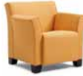
with arms TS31402

Lobby, waiting room, consultation room, doctors' lounge