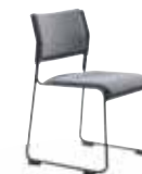
stack chair with cushion TS37101, TS31702 upholstered seat and back