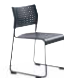
stack chair TS37101