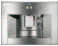
Built-in fully automatic coffee machine Width 24" (60 cm)

CM 210-710 Stainless steel Width 24" (60 cm)