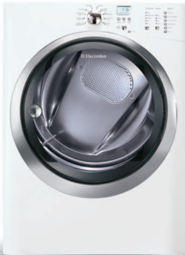
Island White EIED55H IW