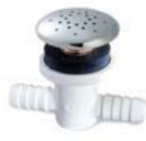
Tees for air jets