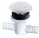
Tees for air jets