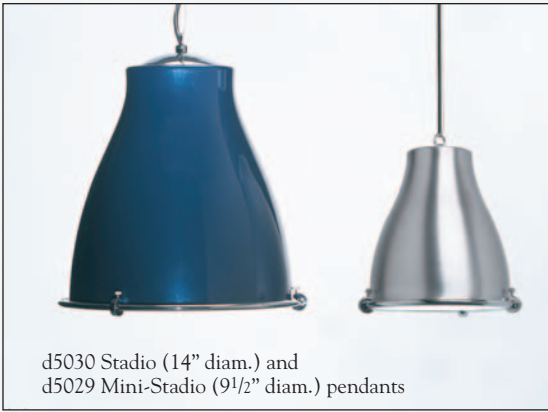
d5030 Stadio (14" diam.) and d5029 Mini-Stadio (9 1/2" diam.) pendants