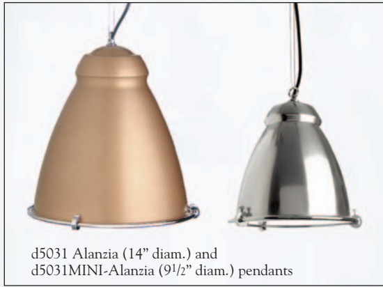
d5031 Alanzia (14" diam.) and d5031MINI-Alanzia (9 1/2" diam.) pendants