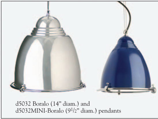
d5032 Boralo (14" diam.) and d5032MINI-Boralo (9 1/2" diam.) pendants